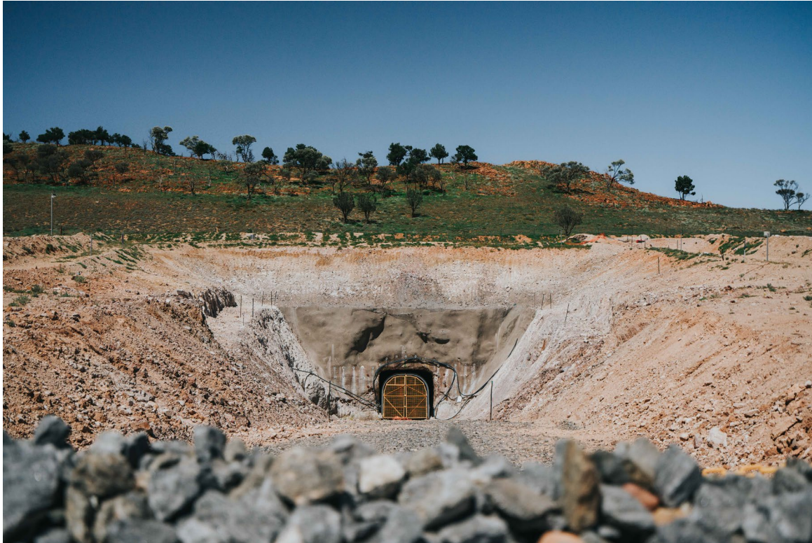
Underground Portal: 4,200 t ore mined