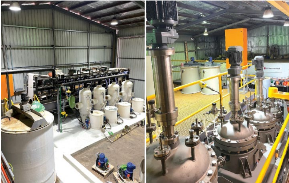
Horizontal vacuum filter belt & Pressure oxidation leach circuit