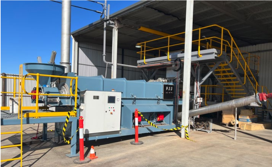
Kiln converts pyrite into pyrrhotite & sulphur