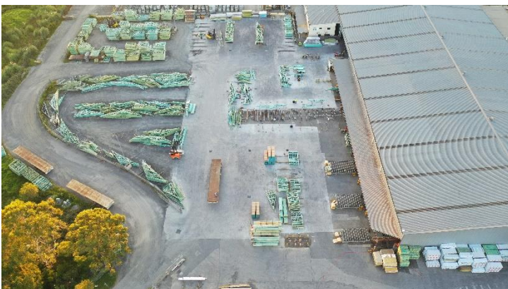
Warnervale Property – industrial land