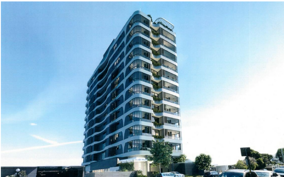
Development Approved Project Design