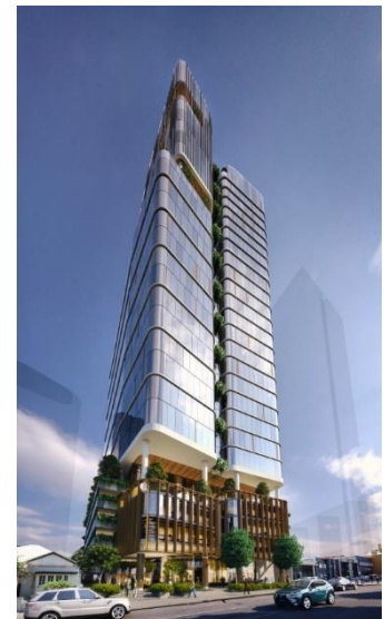
Conceptual Commercial Design