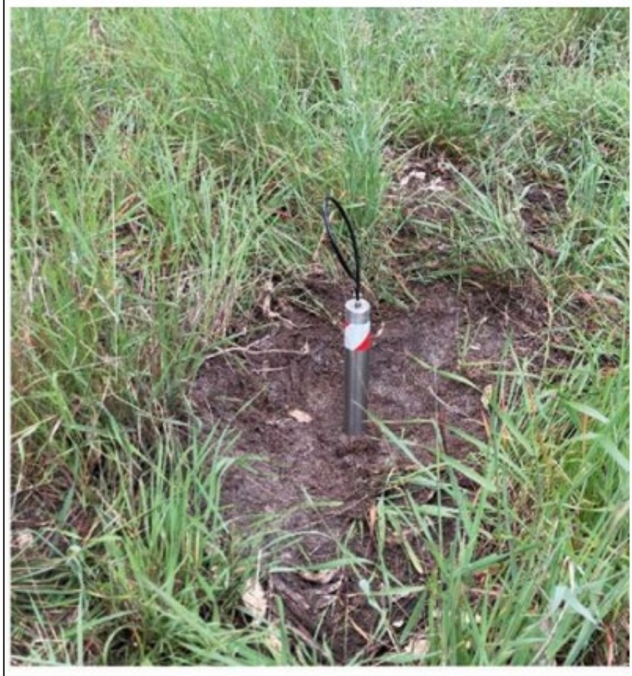
Figure 3 – Mid-term measurement showing monitoring probe.