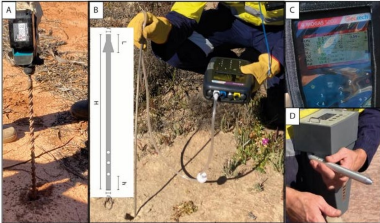
Figure 2 - Instantaneous measurement instrumentation.

A = Hand-held hammer drill; B = GA-5000 coupled with a stainless-steel tube; C = GA multi-gas analyser instantaneous readings; D = PHD-4 portable helium detector (at ppm level)