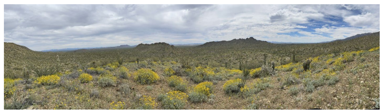
Looking across the Augustus project