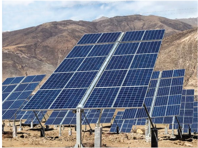
Figure 4: A solar generation project is being evaluated on indigenous community land to complement, and later replace, other energy supplies to the Maricunga project.

Ten holes for a total of 573 metres of RC drilling were completed along existing tracks. The majority of the RC holes were completed to 54m. Four holes, for a total of 360m metres of diamond core, were completed along existing tracks. Three holes were drilled to 100m, and one hole was drilled to 60m. All work was completed safely and in accordance with the strict environmental and dieback hygiene protocols as outlined in the Conservation Management Plan. All sites were rehabilitated on completion of drilling, but the holes remain accessible for further surveying or re-entry as required, pending thin section petrography and RC assay results.