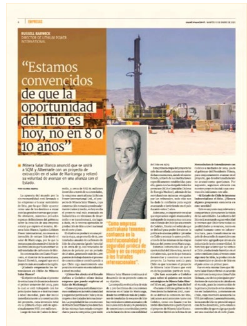
Figure 3: A prominent Chilean newspaper's interview with MSB's Chairman Russell Barwick.

The Policy does not constitute a nationalisation of the lithium industry in Chile. Its objective, as clarified by the Mining Minister, is to set the conditions and parameters for the country to have a more active involvement and higher financial returns in a strategic industry, particularly where those lithium resources are located on concessions already owned by the Chilean State on the Atacama Salar. The NLP also seeks to accelerate the development of new projects in the country.