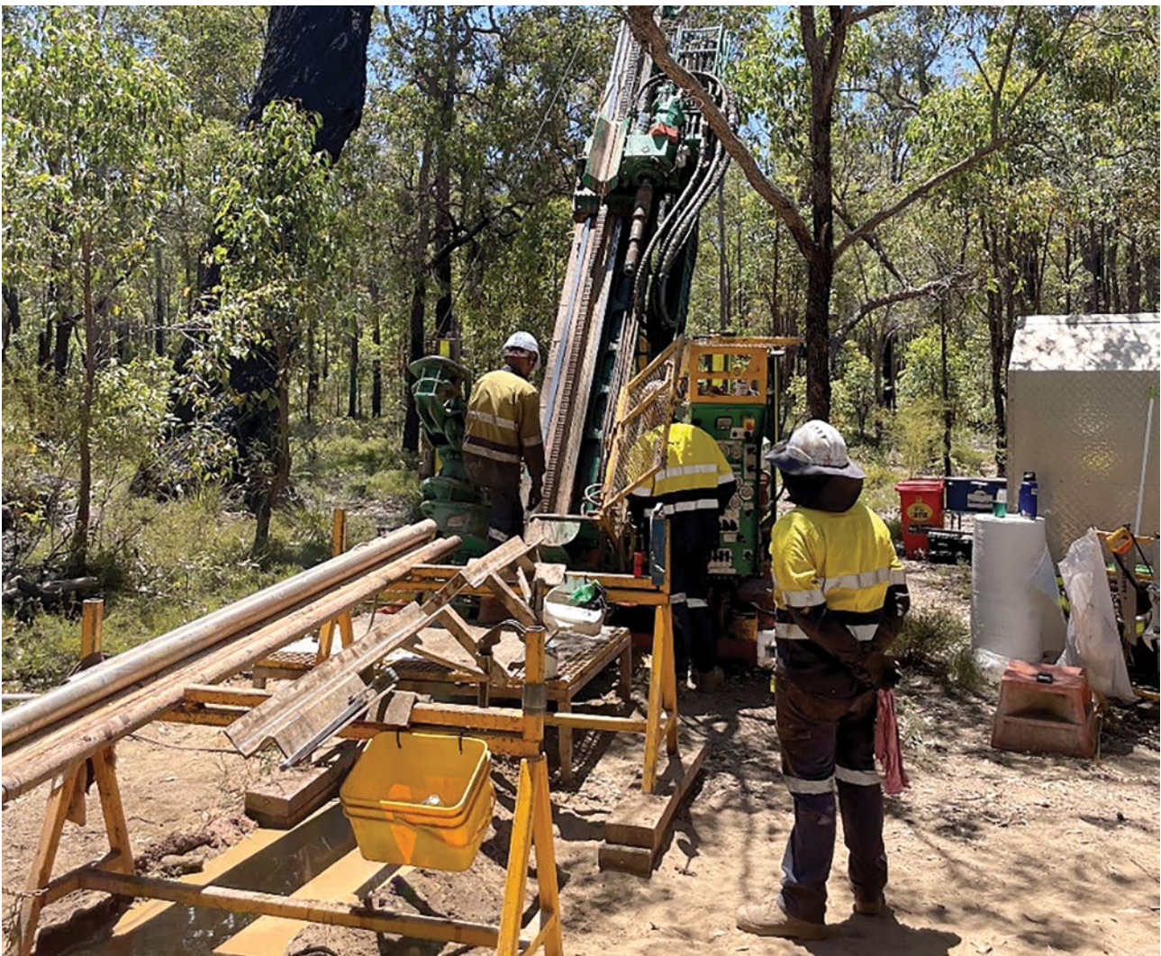
Figure 6: Diamond drilling in January-February 2023 at the East Kirup Lithium Prospect

Anomalies in the east and north showed that mineralisation was open to the east to the Thomas A prospect and further north. A sampling program commenced on the Thomas A area in February, in order to fully define the lithium anomalism. The assays of this partially completed program are pending.