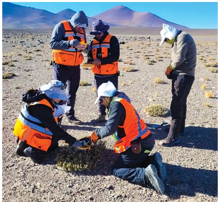
Figure 5: The MSB team, along with local indigenous people, have been collecting seeds for transplantation before construction commences.