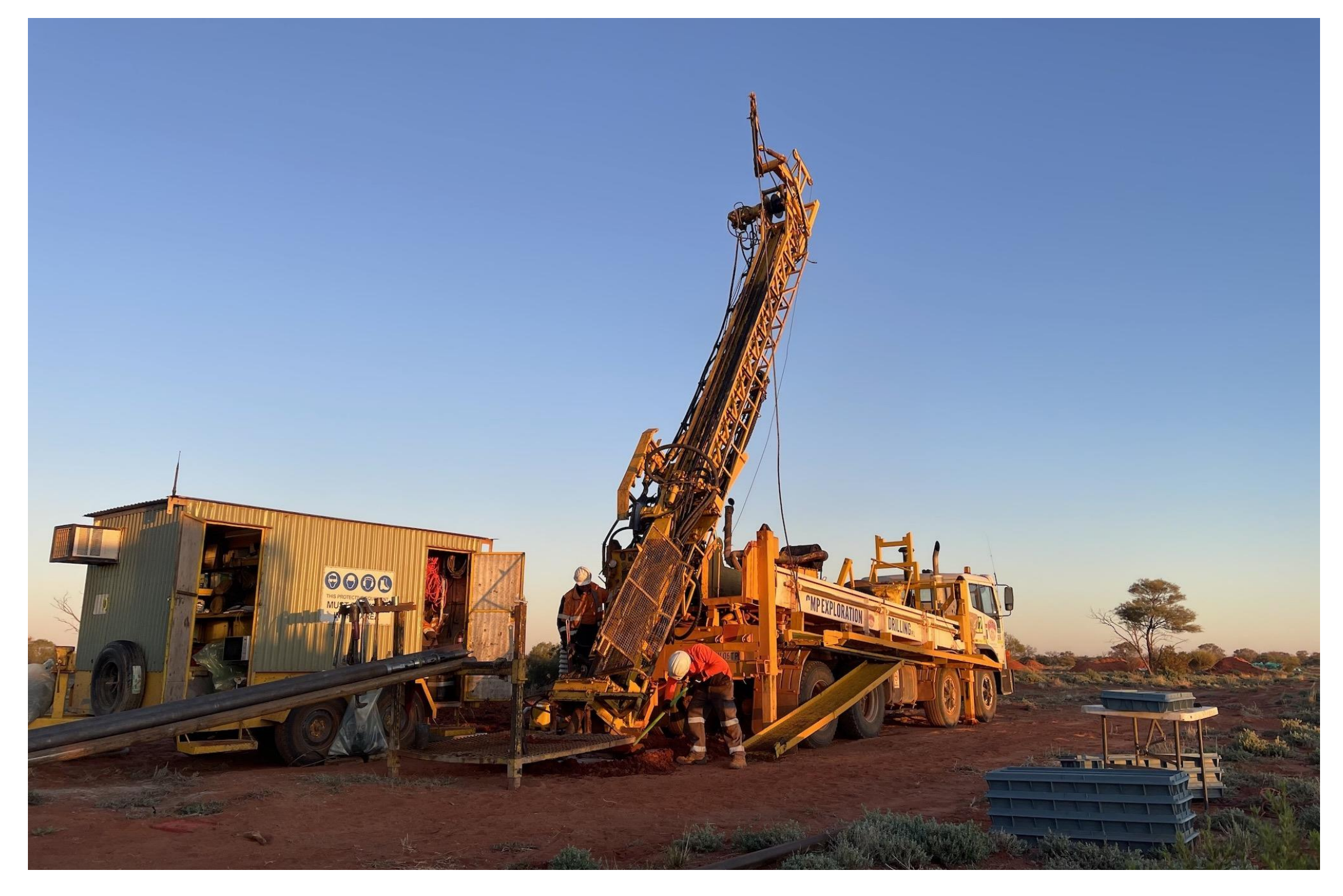
Figure 1: Diamond drillers commencing drilling yesterday at Aurora Tank (10 May 2023)