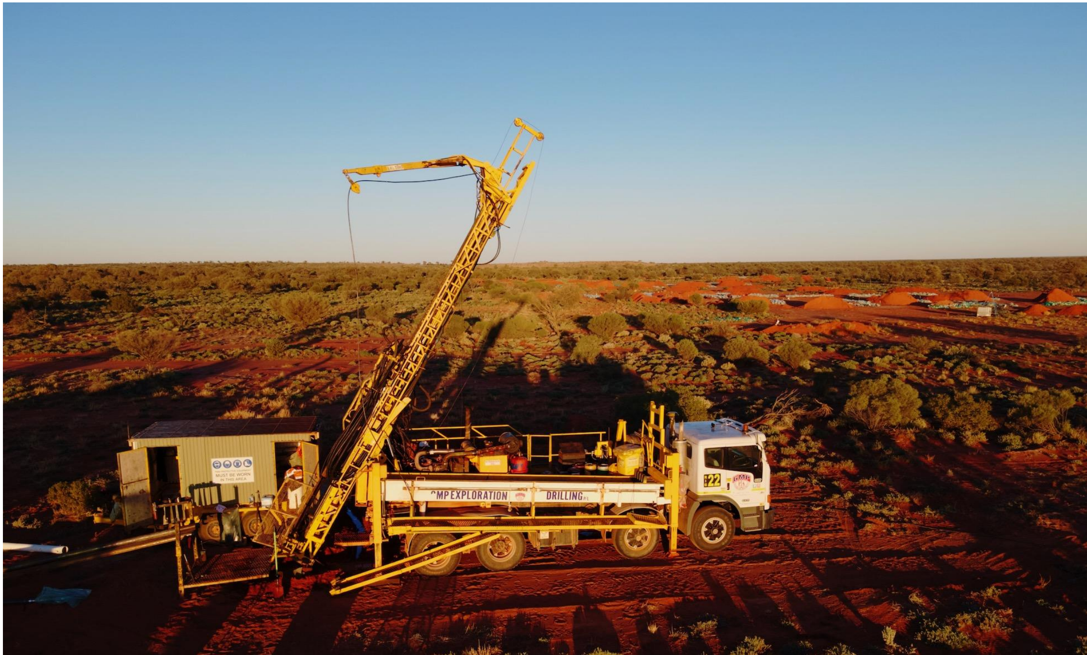
Figure 1: Diamond drilling underway at Aurora Tank (May 2023)