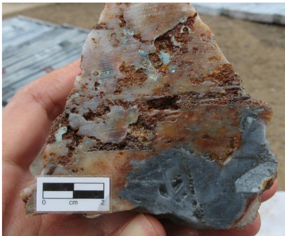
Figure 3: Samples collected from the Aloe Rek prospect area. TOP: quartz vein sample taken from artisanal mining pit, at 20m depth. Vein was 3-5m wide, crystalline quartz with bladed texture, oxidized, 14.9 g/t Au, 22.1 g/t Ag. BOTTOM: sample of quartz vein, taken at 20m depth from an artisanal mining shaft. Sample contains abundant arsenopyrite in lower right part of the quartz. 9.1 g/t Au, 20.5 g/t Ag.