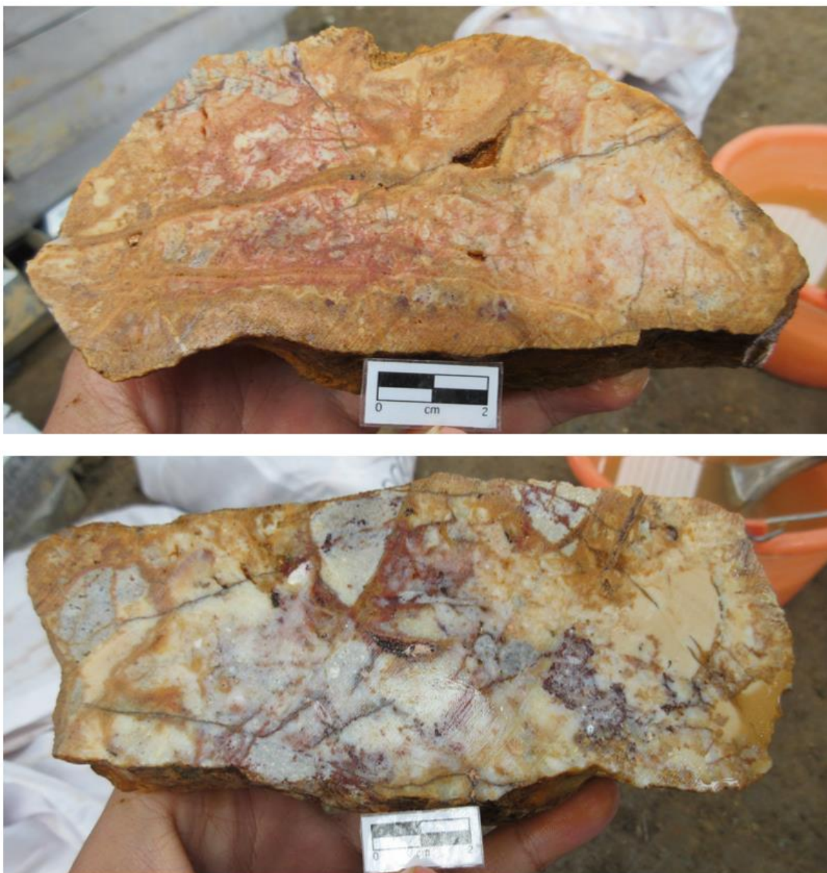
Figure 2: Samples collected from the Kareung Reuboeh prospect. TOP: from quartz stockwork zone, 1-2m wide, intensely silicified andesite wall rock, 28.42 g/t Au. BOTTOM: from quartz stockwork zone, 1-2m wide, intensely silicified andesite wall rock, 58 g/t Au.