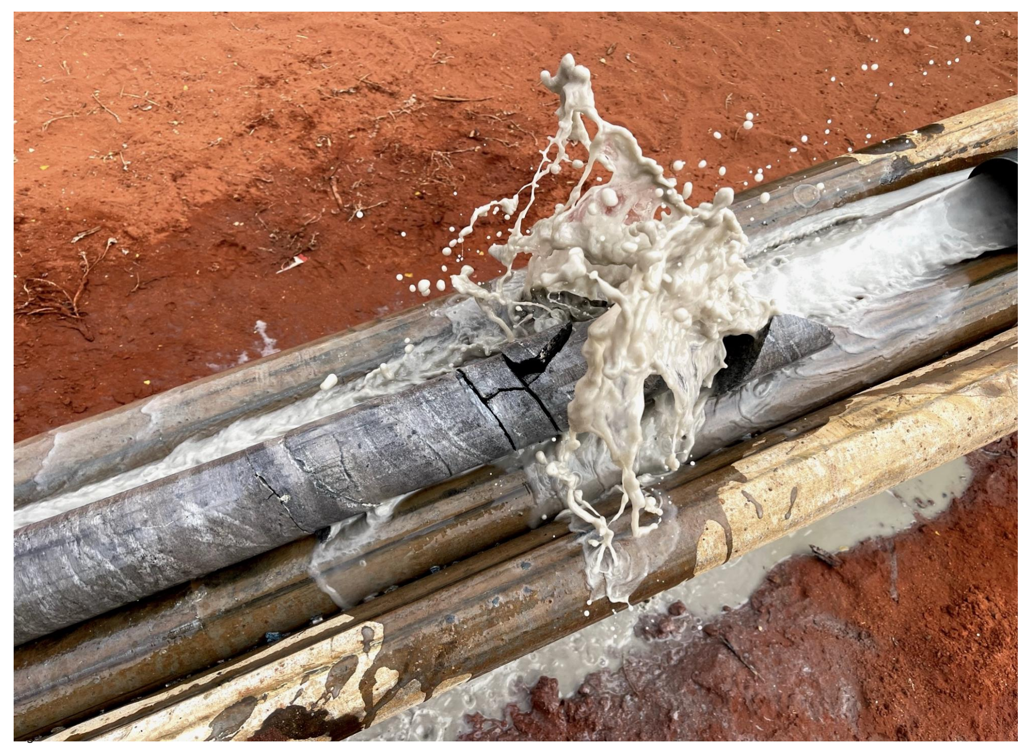
Figure 1: Diamond core being pumped out of the drilling rods at Aurora Tank (May 2023)