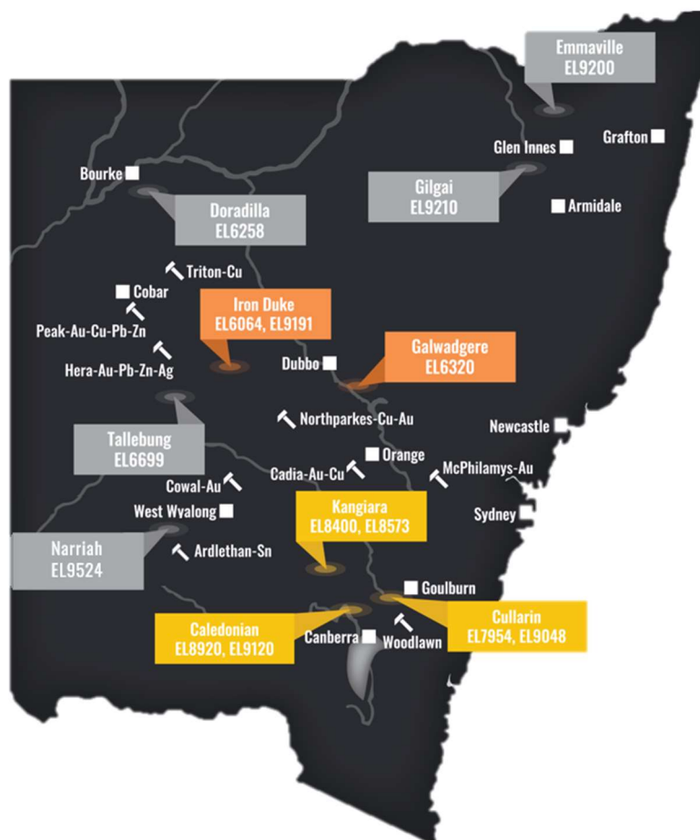
Figure 2: SKY Tenement Location Map

Highlight, 'McPhillamys-style' gold results from previous exploration include 36m @ 1.2 g/t Au from 0m to EOH in drillhole LM2 and 81m @ 0.87g/t Au in a costean on EL8920 at the Caledonian Project.