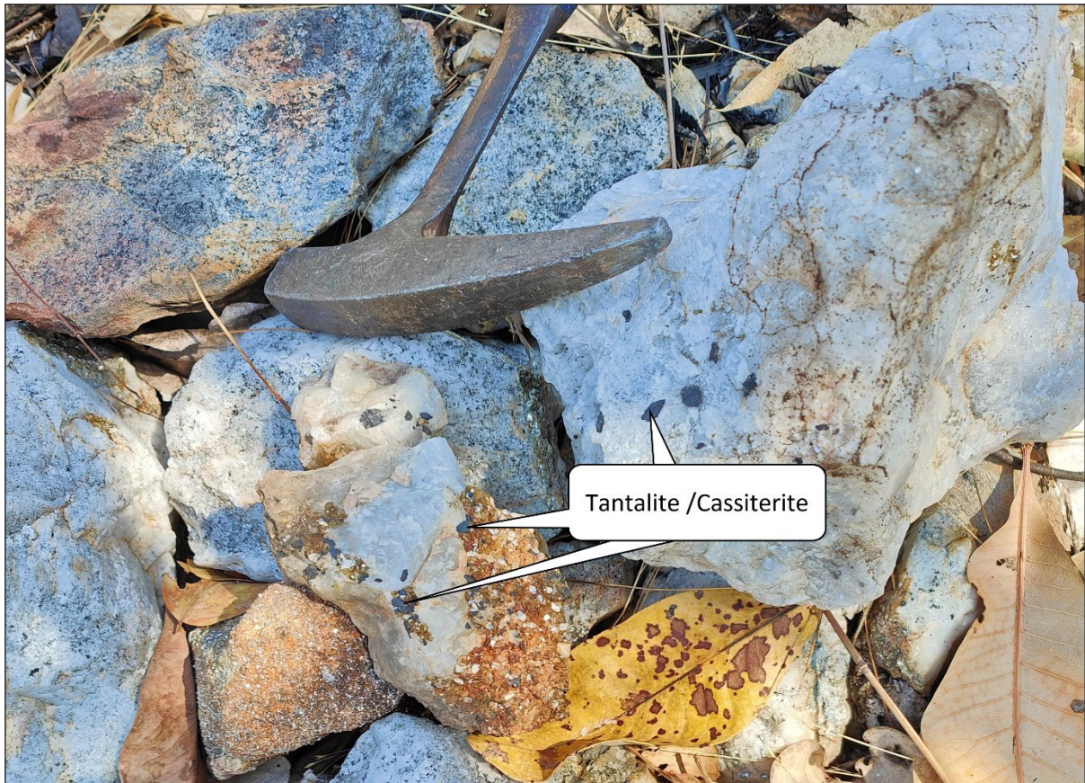
Figure 1. Sample SM023