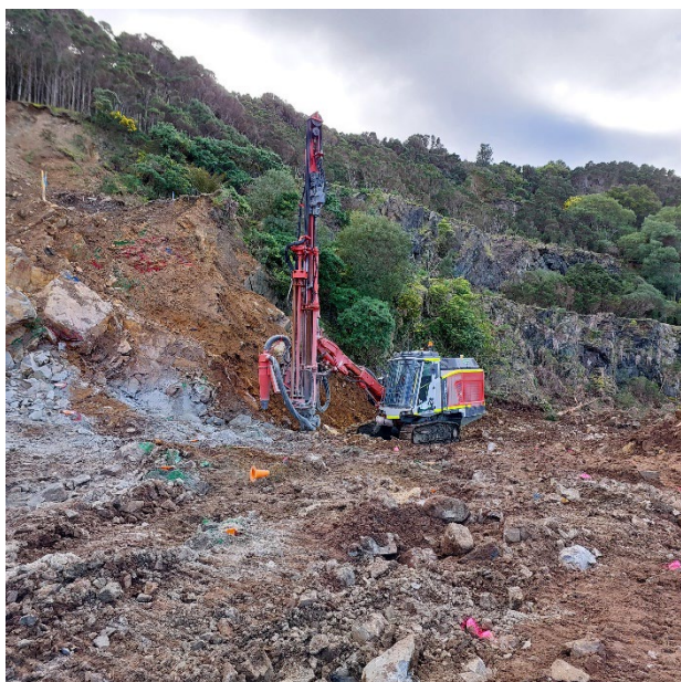
Figure 2 - Drilling ongoing in "West Pit" on western side of Dolphin Open Cut

The site team has also successfully completed its first production blast following a seed trial blast programme completed at the end of July. The seed trial confirmed the blast modelling and has provided design input into the production blasting design.