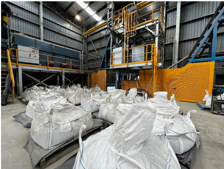
Figure 1- High Grade Concentrate to be loaded in container for second shipment

Group 6 Metals Limited (ASX: G6M, “Group 6 Metals” or the “Company”) is pleased to provide an update on its operational activities at the Company’s wholly owned Dolphin Tungsten Mine (“DTM”), located on King Island, Tasmania.