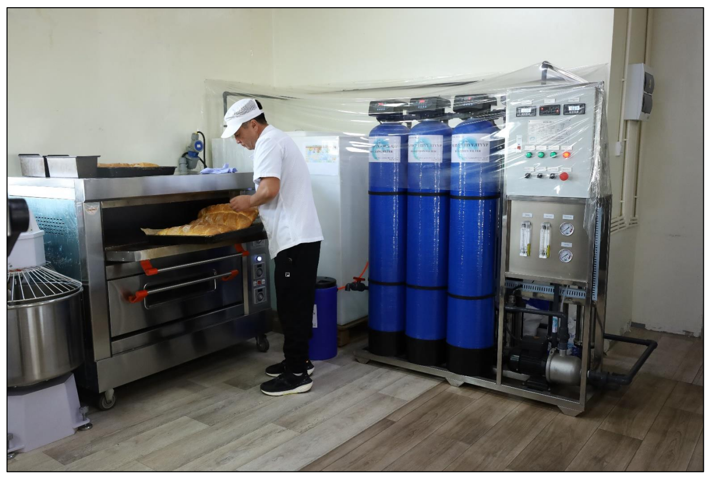
Figure 5: New Kharmagtai Water Filtration Systems