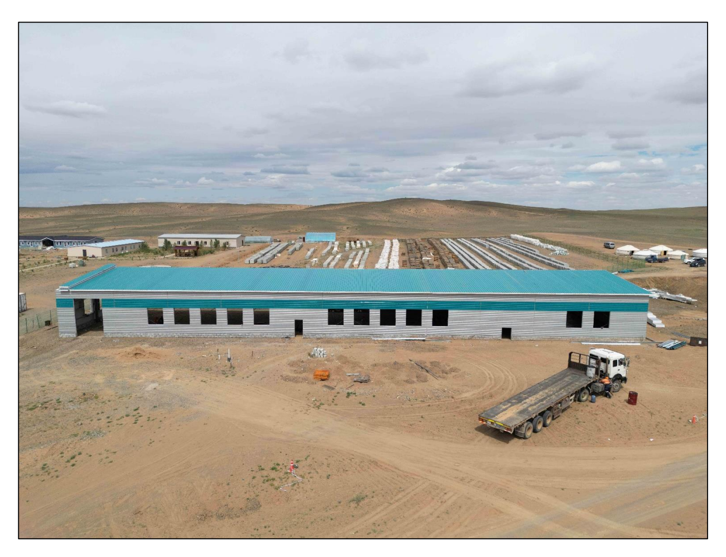
Figure 2: New Core Processing Facility under construction

The new Kharmagtai core processing facility currently under construction ( Figure 2 ) will replace the current core shed which was over 20 years old, reaching the end of its useful life, and designed only for an early-stage exploration project. The new facility will use a modern design and flow sheet and include specific facilities for modern scanning equipment, offices, meeting room and technical review facilities, as well as traditional core cutting, logging and processing.