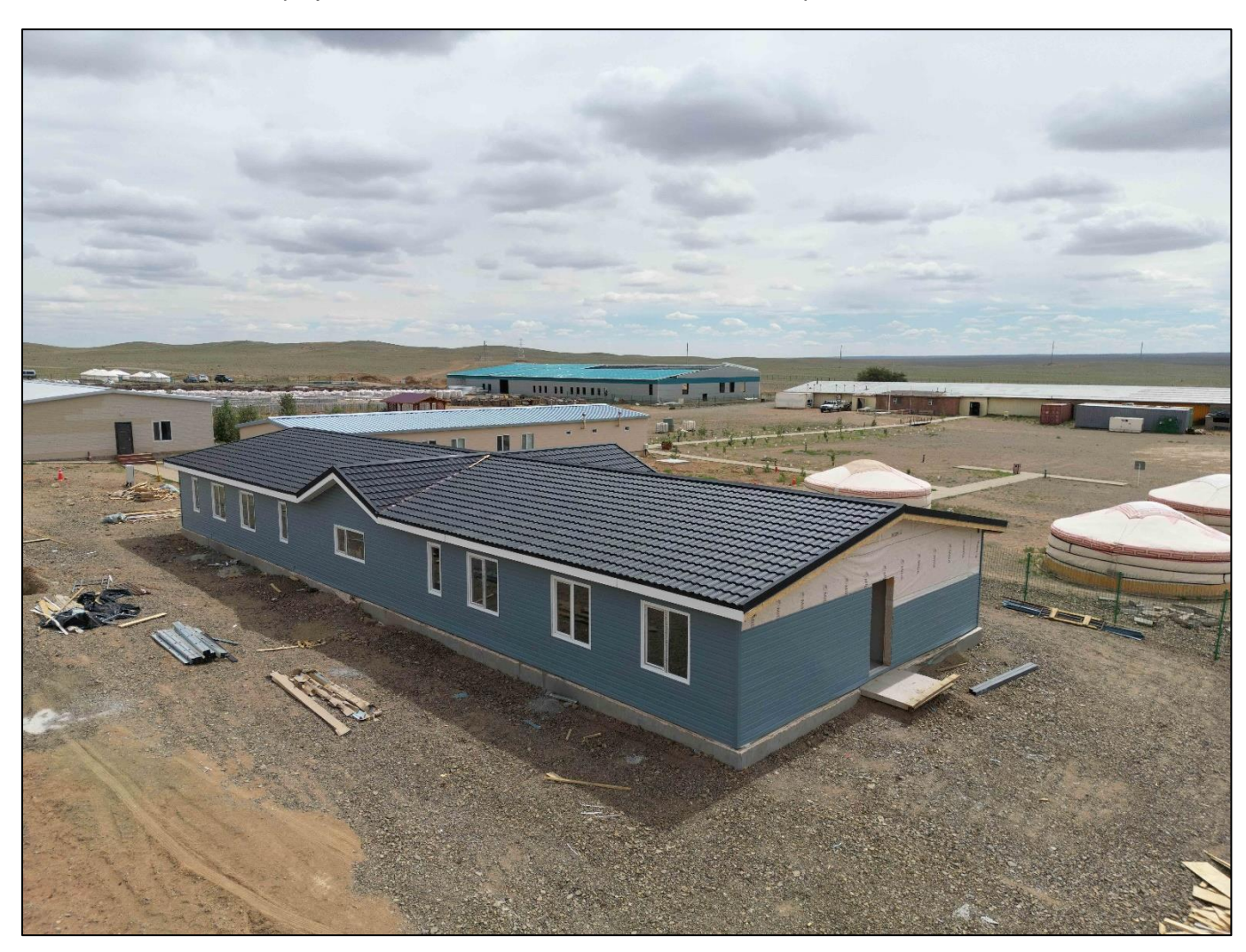
Figure 3: New Accommodation Block under construction.

The Kharmagtai project is building additional, modern, 30 bed accommodation block ( Figure 3 ) for expanded workforce on site as the project moves toward construction and eventual operation.