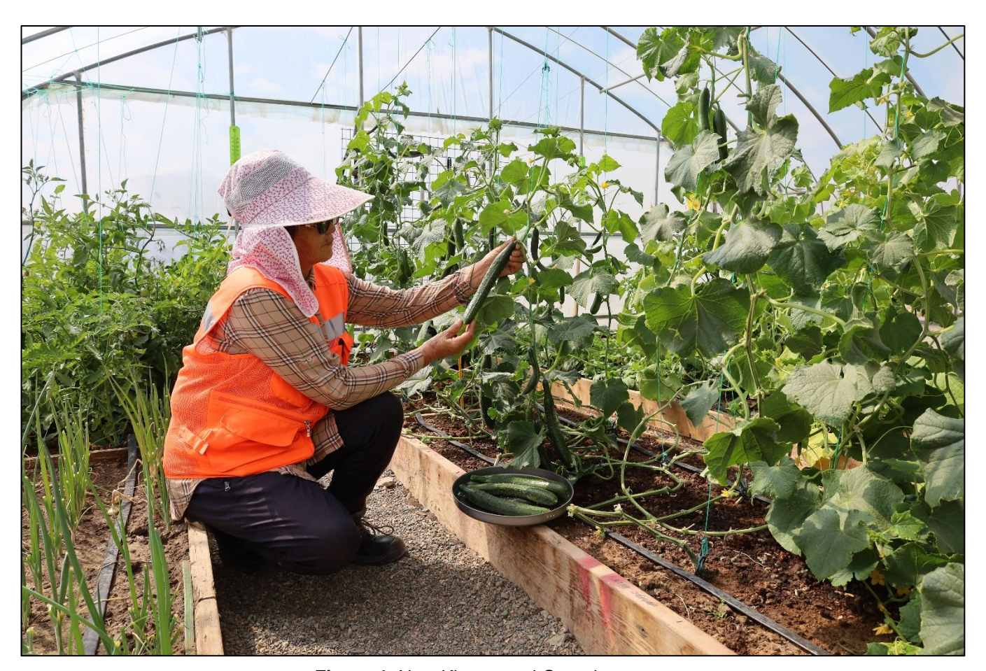
Figure 4: New Kharmagtai Greenhouse

Accompanying this is a greenhouse on site which employs locals to provide long term, locally sourced food for employees ( Figure 4 ). A new water filtration system was also installed to reduce use of bottled water and creation of plastic waste ( Figure 5 ).