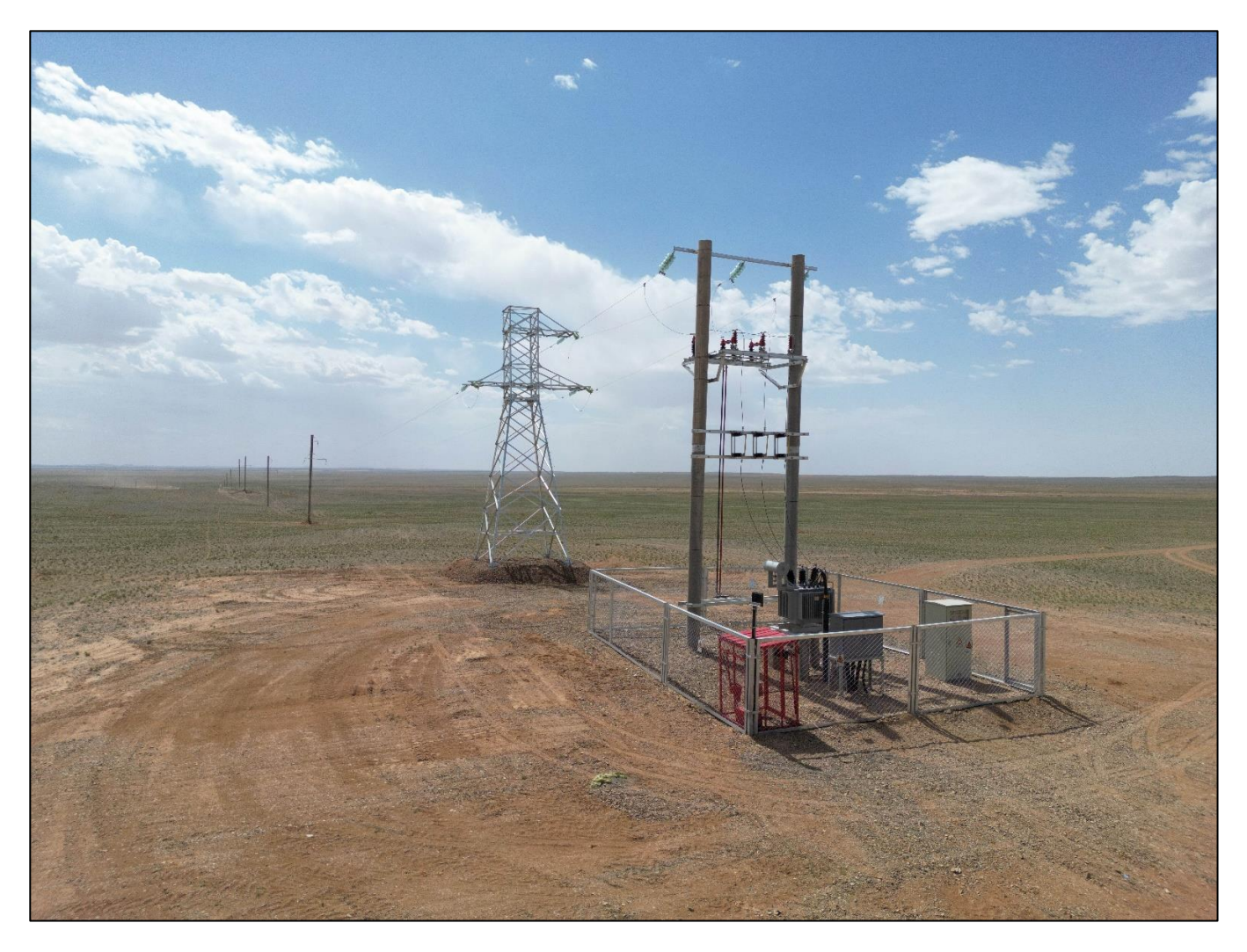
Figure 1: 35kV connection to Mongolian SEDN grid.

The 35kV connection to the grid ( Figure 1 ) was completed ahead of time and on budget, enabling the Kharmagtai project to convert to electric power from the grid and shift its diesel gensets into backup mode. This will significantly reduce diesel usage and therefore Scope 1 emissions on site. The connection provides sufficient power to meet current needs and is expandable with the same poles to meet future construction needs as Kharmagtai moves toward an operating mine.