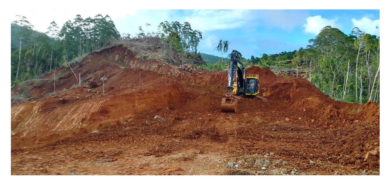
Photo 1. Haul road construction on schedule, heading up to the first ore blocks

The following are recent photos from site: