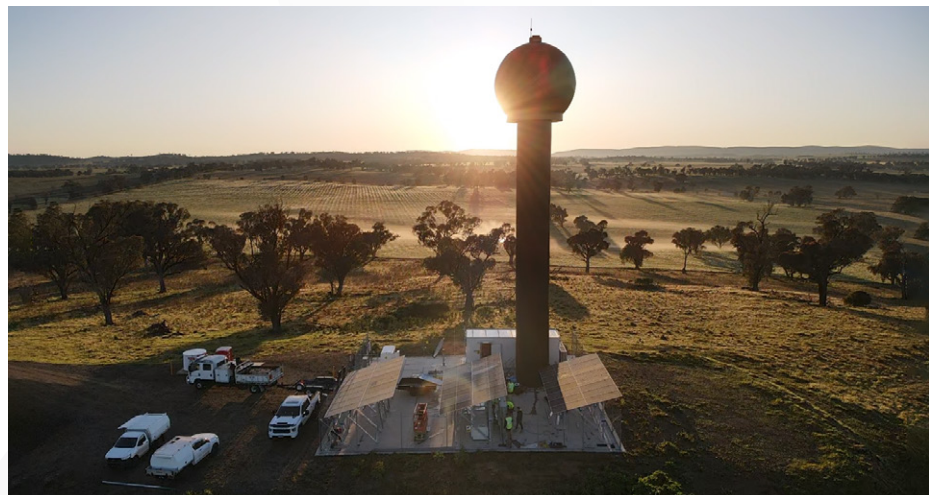
Redflow batteries installed at a Bureau of Meteorology weather radar location.

After a number of frustrating supplier challenges in our Thailand manufacturing facility in early 2023, full production is now back on-line, and we are accelerating our scale up to meet this level of current orders and conversion of additional sales from our pipeline. The facility is now well placed to scale up to 80 MWh p.a. over the next 12 months as battery delivery requirements and timing is confirmed.