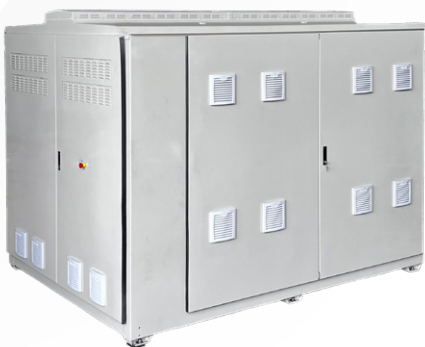
Redflow's EnergyPod 200.

Redflow's continued focus on the commercial and industrial applications in the priority Australian and United States markets has also dramatically improved and expanded our sales pipeline, which now stands at over 6 GWh of qualified opportunities. Importantly, a number of opportunities which are at detailed customer engagement stage, representing approximately 70 MWh of total battery demand in addition to the orders already received for delivery in 2024 and early 2025.