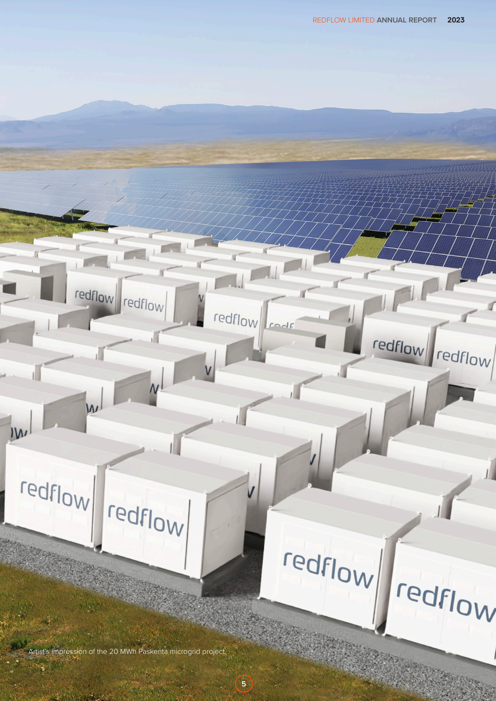
Artist's impression of the 20 MWh Paskenta microgrid project.