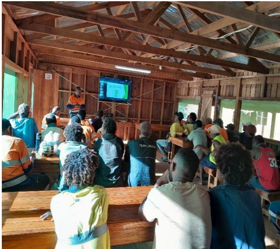
Photo 5. Site Inductions underway for contractors and local staff