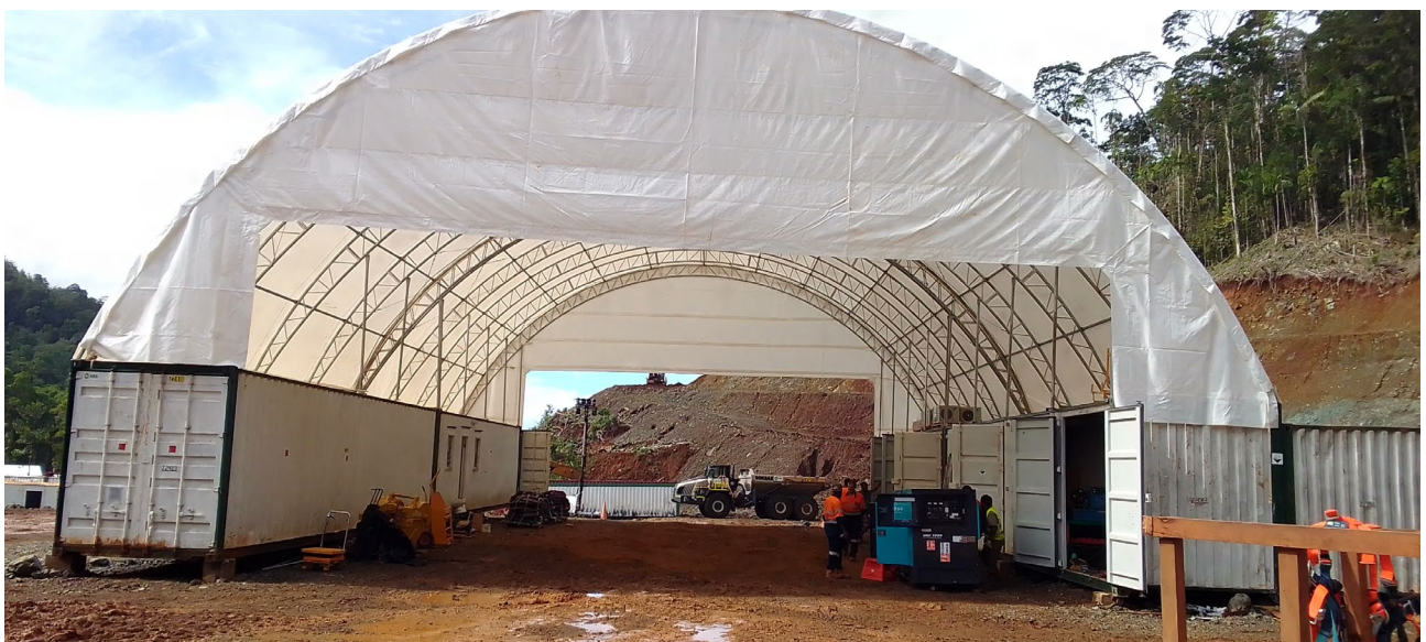
Photo 4. Mining contractor workshop area established