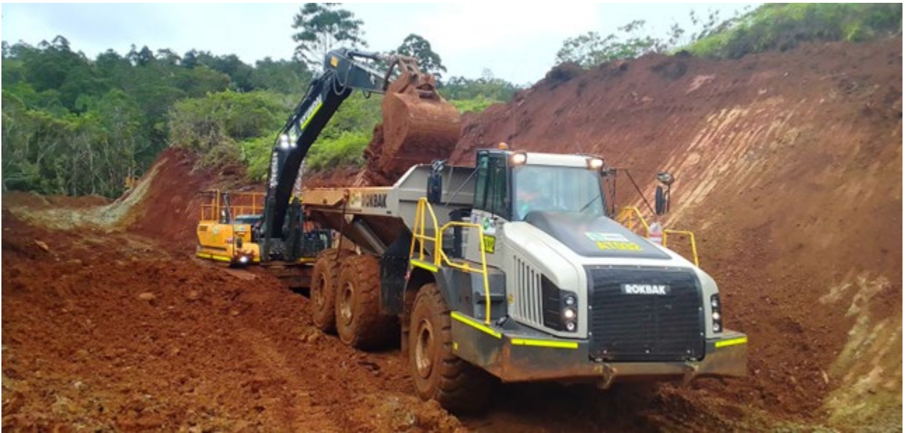
Photo 1. Removal of overburden in the first ore blocks for the mining of ore planned to commence in October 2023