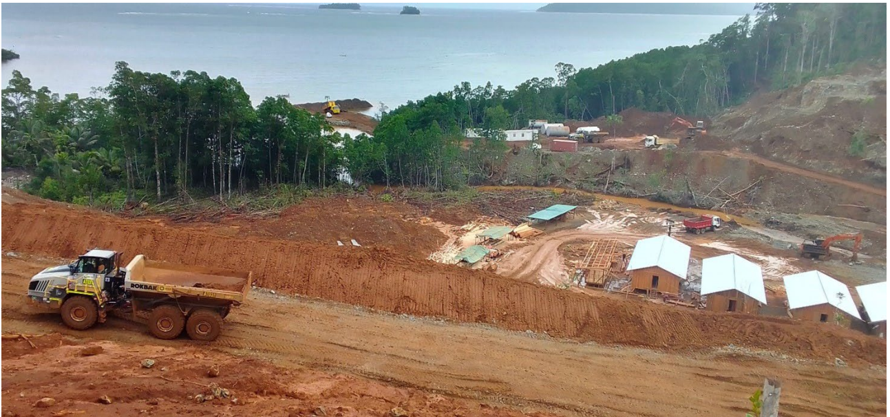
Project Overview. Mining truck and camp in foreground, mining contractor site in the middle-ground and wharf construction in the distance.