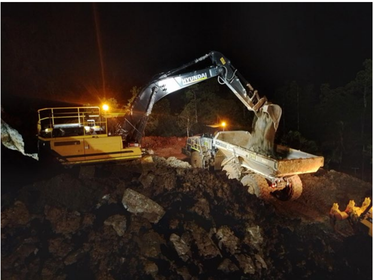
Photo 2. Two-shift (24-hour) operations commenced utilising lighting plants in line with the long-term operational requirement for continuous operations