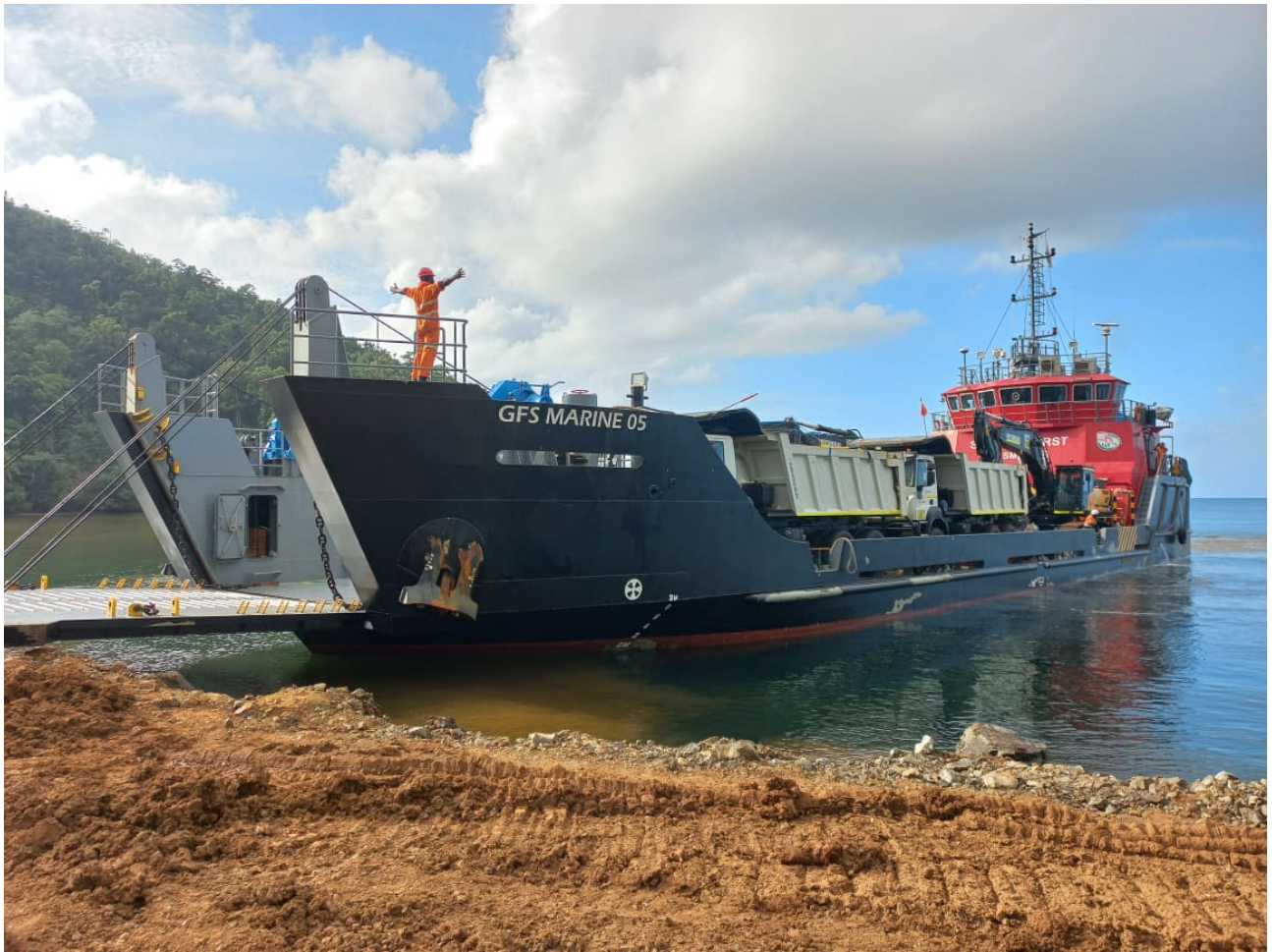
Photo 3. Second tranche of equipment being delivered to site establishes the full complement of earth moving equipment necessary to undertake mining operations