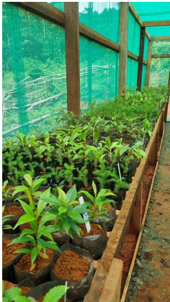
Photo 6. Plant nursery established to provide native plants for progressive site rehabilitation