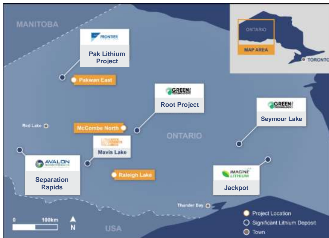
Figure 2: Bastion Minerals Project Locations (Ontario, Canada) and other major projects and companies.

The early exercise of the Option now allows Bastion to commence activities at the Pakwan East Project where exploration is expected to commence in the current quarter and will focus on a series of mapped pegmatite clusters, including two clusters measuring more than 1km.