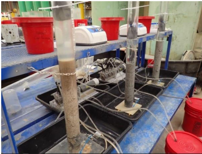
Figure 4a: Vat leaching lab setup

Sulfuric acid heap leaching is typically used in the mining industry for low-grade ores. The crushed ore is configured into a large mound or heap on a lined leach pad. A leaching solution is then sprayed or dripped onto the top of the heap, percolating through and is collected from the base as a pregnant leach solution (PLS). The heap leaching operation is simulated, in the lab, by an ore column where the leach solution is applied to the top of the column and collected at the bottom.