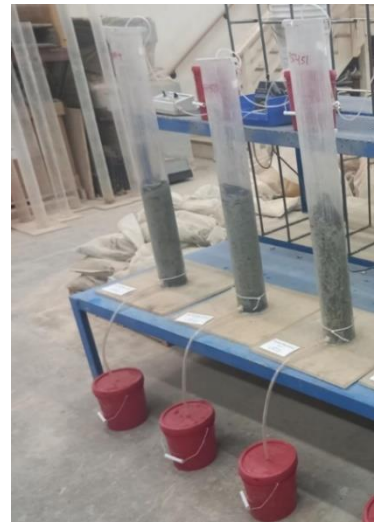
Figure 4b: Heap leaching simulated by top fed columns

Figure 4 – Laboratory leach tests to simulate vat and heap leach methods.