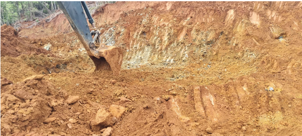
Photo 1. First mining of nickel ore for shipment at Kolosori Nickel Project

“The first mining of saprolite ore for shipment is a significant milestone for the Company and another step towards first revenue for the Company from the Kolosori Nickel Project”