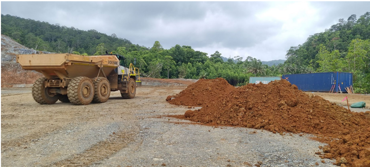
Photo 2. First stockpiling of Nickel Ore in preparation for shipment