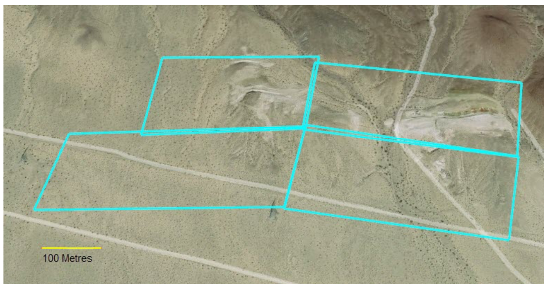
Figure 1: Google Earth view showing the four patented mining claims that make up the Argos Strontium Project

At present there is no operating strontium mine or strontium carbonate production facility in the USA 1,2 . The Argos deposit is comprised of four patented mining claims that cover 75 acres and is considered to be the largest strontium deposit in the USA 5 .