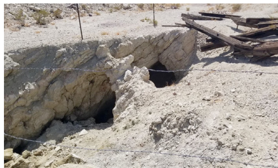
Figures 4 & 5: Argos Trench, looking west and historical celestite workings (Source Gregg Wilkerson, April 2021) 5