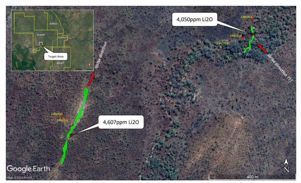
Figure 1. NT Lithium Project - Drillhole Location Plan

The Company also received results from diamond drilling works conducted at the Tank Hill prospect, targeting two parallel pegmatite bodies exposed at surface, where two diamond drillholes were completed and confirmed pegmatite intercepts.