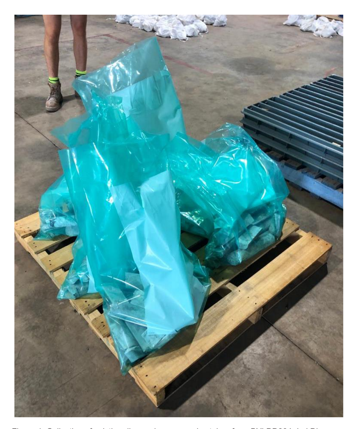
Figure 1: Collection of existing diamond core samples taken from BYLDD004, Lei Discovery