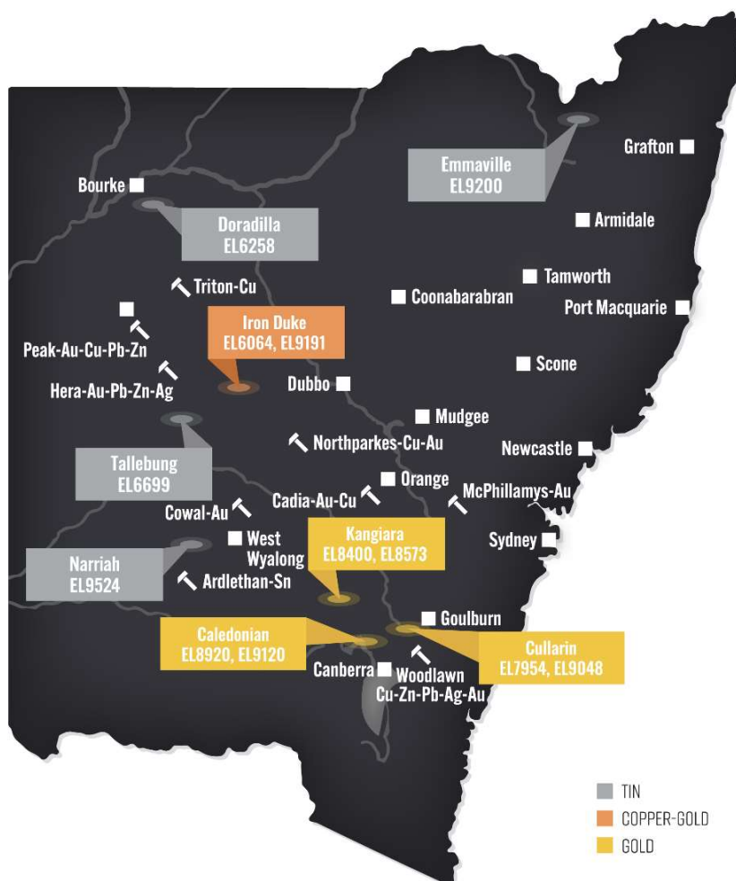
Figure 2: SKY Tenement Location Map

Highlight, 'McPhillamys-style' gold results from previous exploration include 36m @ 1.2 g/t Au from 0m to EOH in drillhole LM2 and 81m @ 0.87g/t Au in a costean on EL8920 at the Caledonian Project.