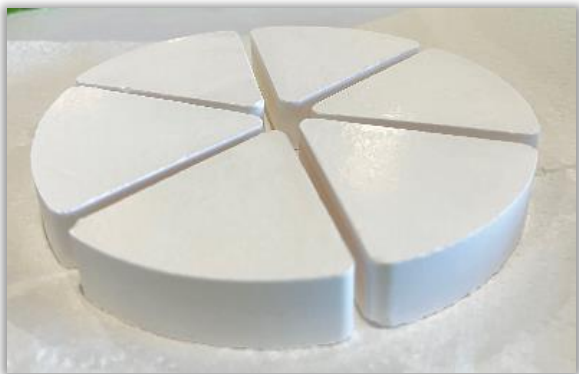
Sintered HPA feed material from the HPA First Project

In June 2023, the agreement between Alpha and Ebner-Fametec was expanded to include a Letter of Intent to work co-operatively on an additional, large-scale expansion of the Australia based sapphire growth installation, to be referred to as the ' Nova Phase '. The Nova Phase will contemplate the purchase, construction, installation and operation of up to an additional 1,000 synthetic sapphire growth units.