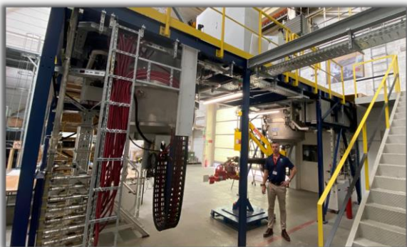
Twin set of sapphire growth units (Fametec Austria)