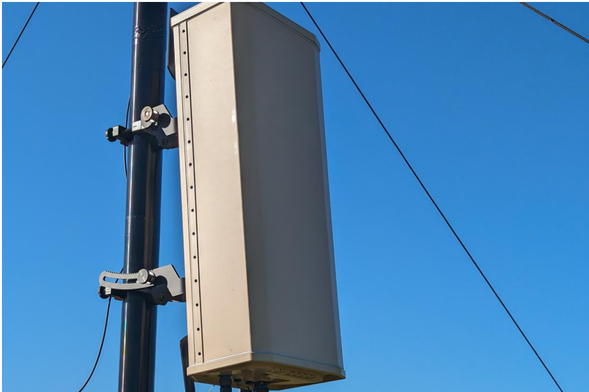
Image: DroneCannon Mk2, DroneShield's wide area non-kinetic effector

"The addition of proven C-UAS jammers, such as DroneCannon Mk2, is part of Agile Shield's planned transition from the virtual world to field demonstrations which occurred in October 2023."