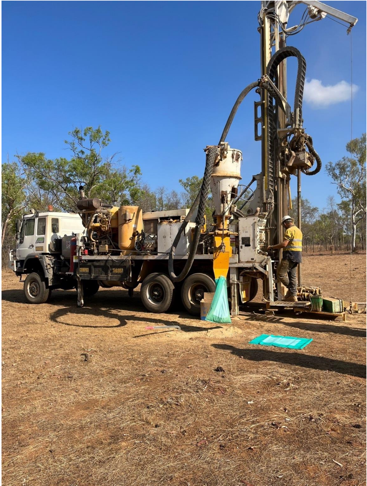
Image 1: The mounted Aircore RC drill rig on site at Ark's 100%-owned Sandy Mitchell Rare Earths Project.