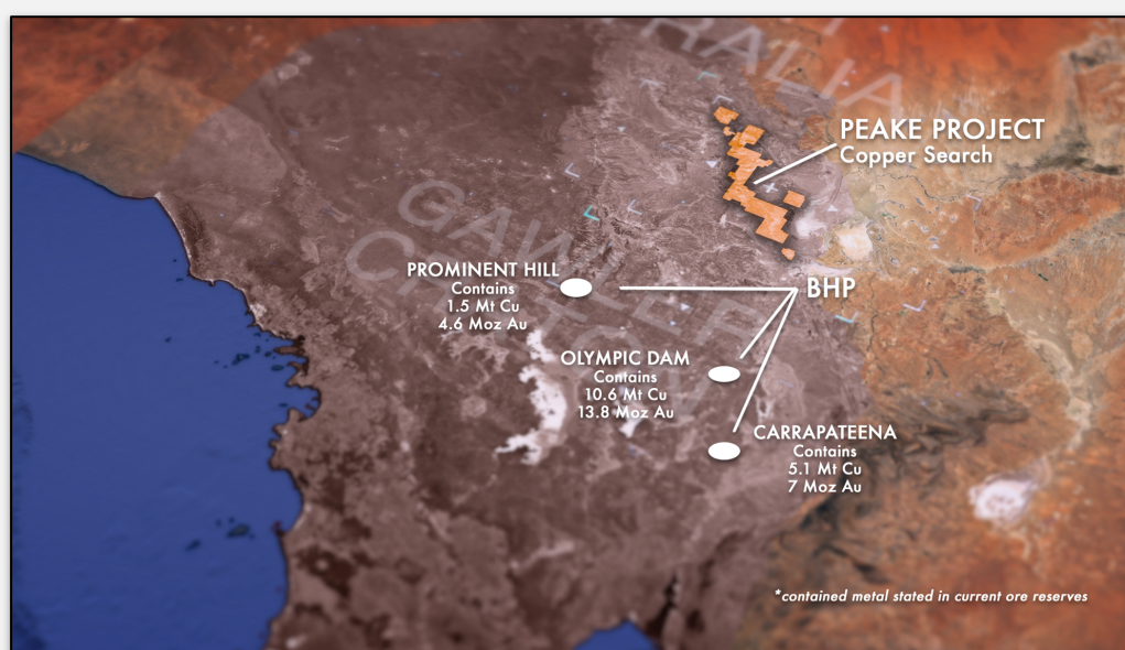
Figure 1 Location map of the Peake Project, Peake & Denison Domain - Gawler Craton, South Australia. Major mines in the area owned by BHP indicating Ore Reserves of contained tonnes of copper and ounces of gold, sourced from company reports.