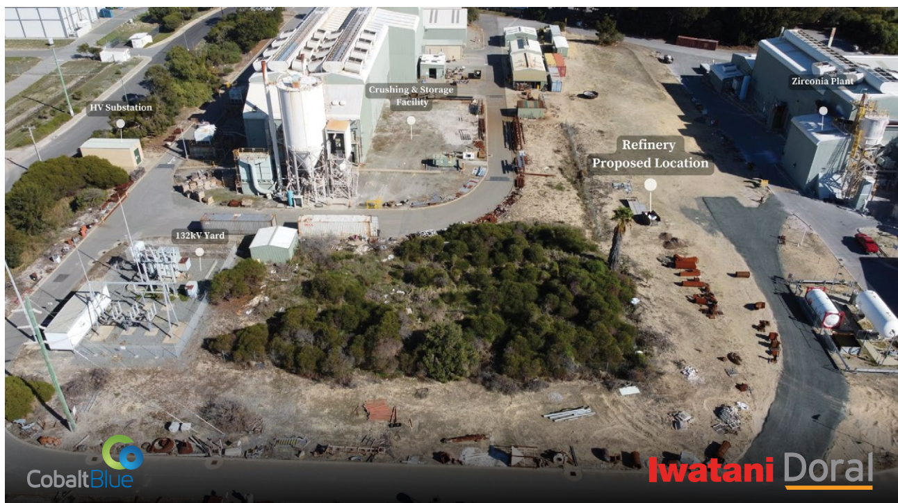
Figure 1 – Aerial view of the proposed Refinery project site (owned by Iwatani Australia)

Ready access to power, utilities and infrastructure makes the proposed location of the refinery highly desirable. The pictures below show the proposed Refinery project site overview and layout as well as the district location in relation to nearby logistics and other landmarks.