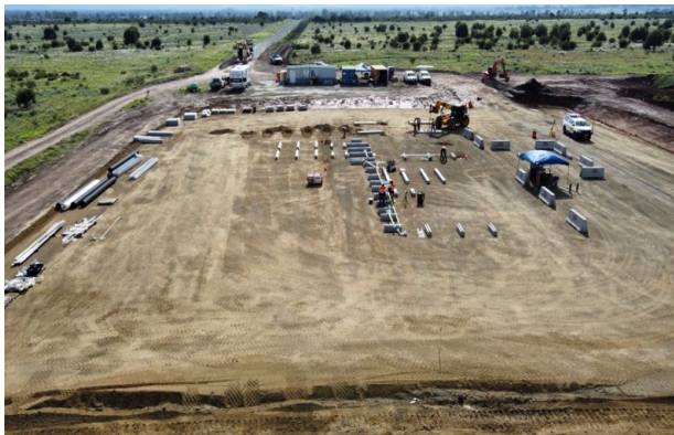
Figure 1: Completed CNG Facility pad

Trenching and pipework is now complete, with the gathering system connecting the Rougemont 2/3 dual lateral well to the CNG facility inlet point. Surface rehabilitation of the pipeline corridor is in progress.