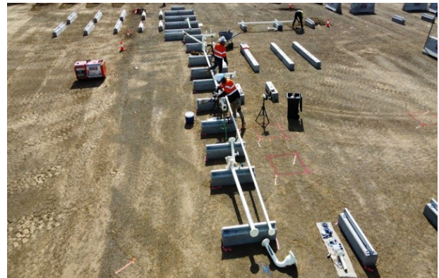
Figure 2: Mechanical crews commencing plant construction

The Company remains on track for mechanical completion of the CNG Facility and the start of plant commissioning activities in mid-January 2024. The Company intends to commence initial gas sales through its virtual pipeline as part of the commissioning process.