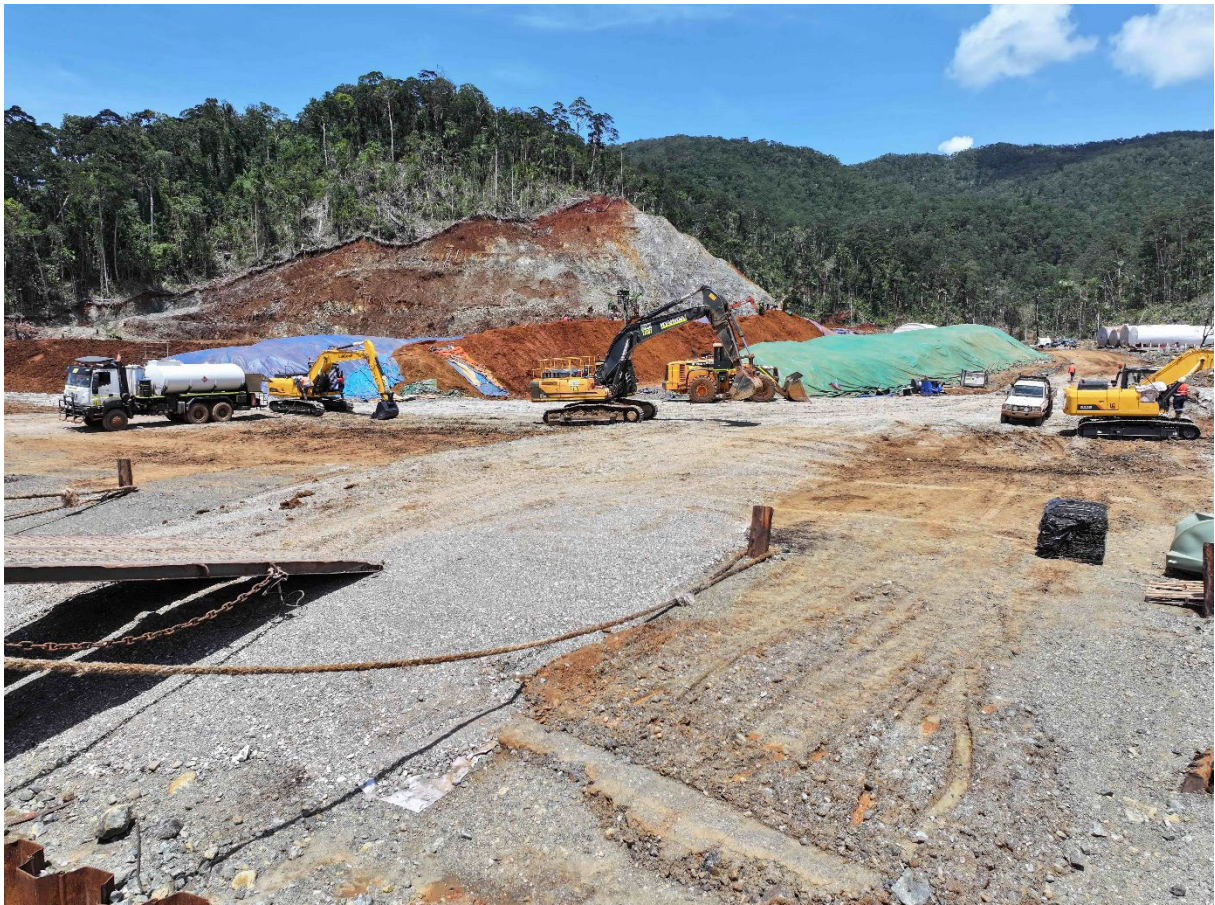
Photo 3 – Kolosori Project Site and stockpiles located near to the Kolosori Wharf