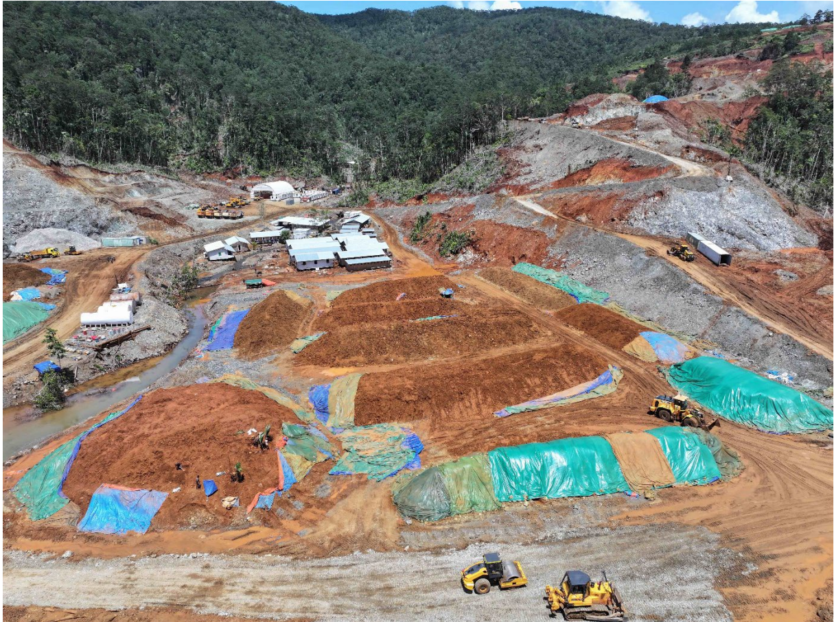
Photo 2 – Kolosori Project Site and stockpiles located near to the Kolosori Wharf