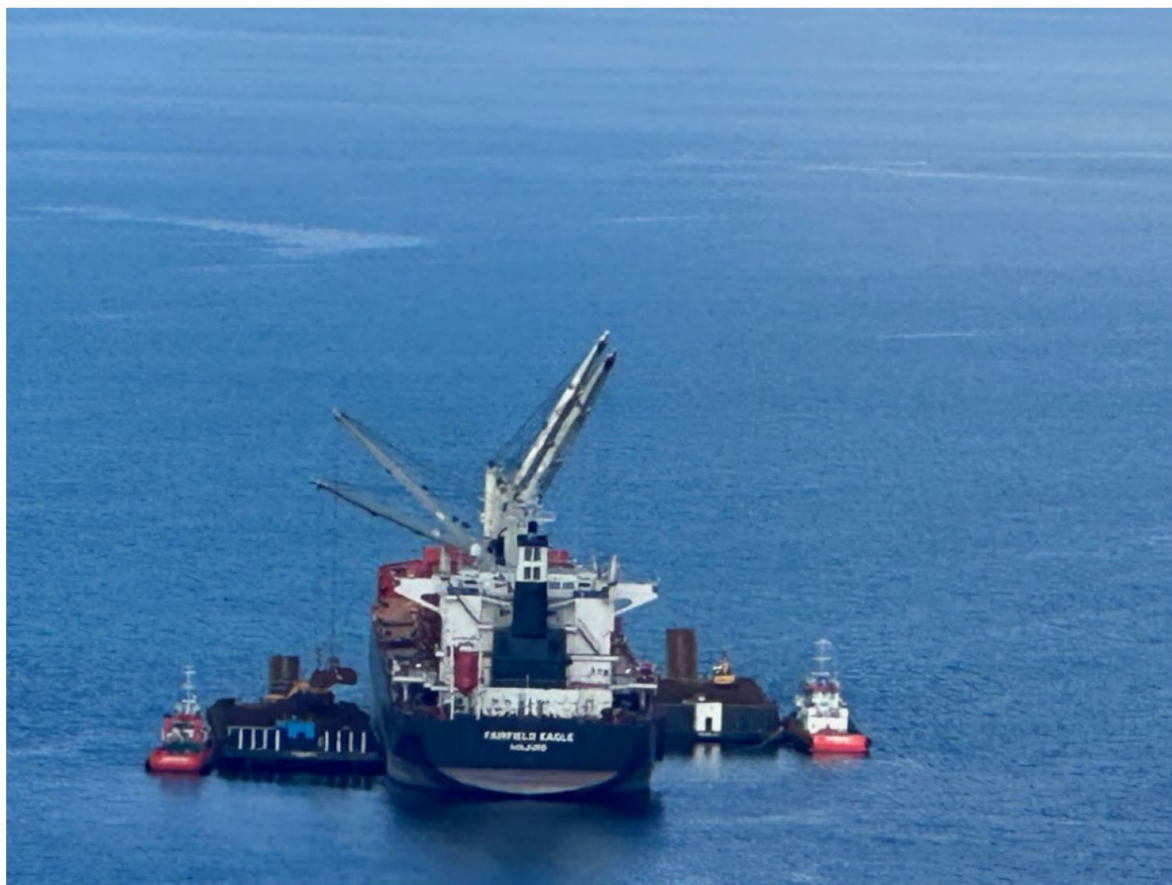
Photo 6 – Loading on nickel DSO showing barges on each side of the ship