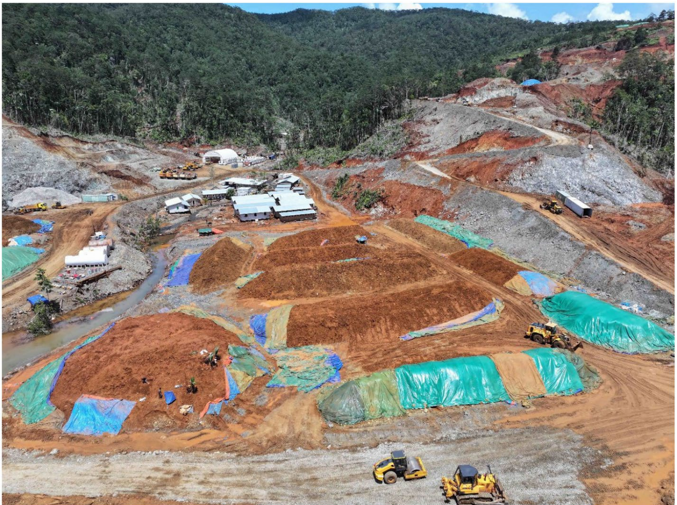
Photo 1 – Kolosori Project Site and stockpiles located near to the Kolosori Wharf

During the quarter, the Company advanced mining operations in the lead up to first shipment. Mining of nickel ore commenced on 1 October 2023 and the Company rapidly advanced stockpiling of ore for the first DSO shipment.