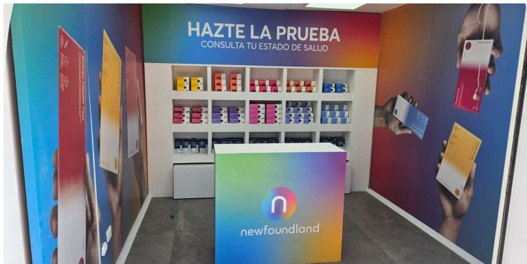
Newfoundland's new innovative consumer self-test store in Bogota, Colombia

During the period, Atomo assisted Newfoundland to submit for registration with the Colombian regulator, with approval anticipated in the coming months. In parallel, Newfoundland have opened the world's first retail store dedicated solely to rapid self-testing in Bogota, Colombia.