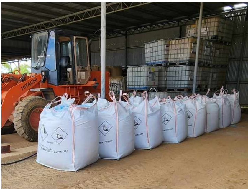
Bags of Copper Sulphate ready for shipment (taken 12 January 2024).