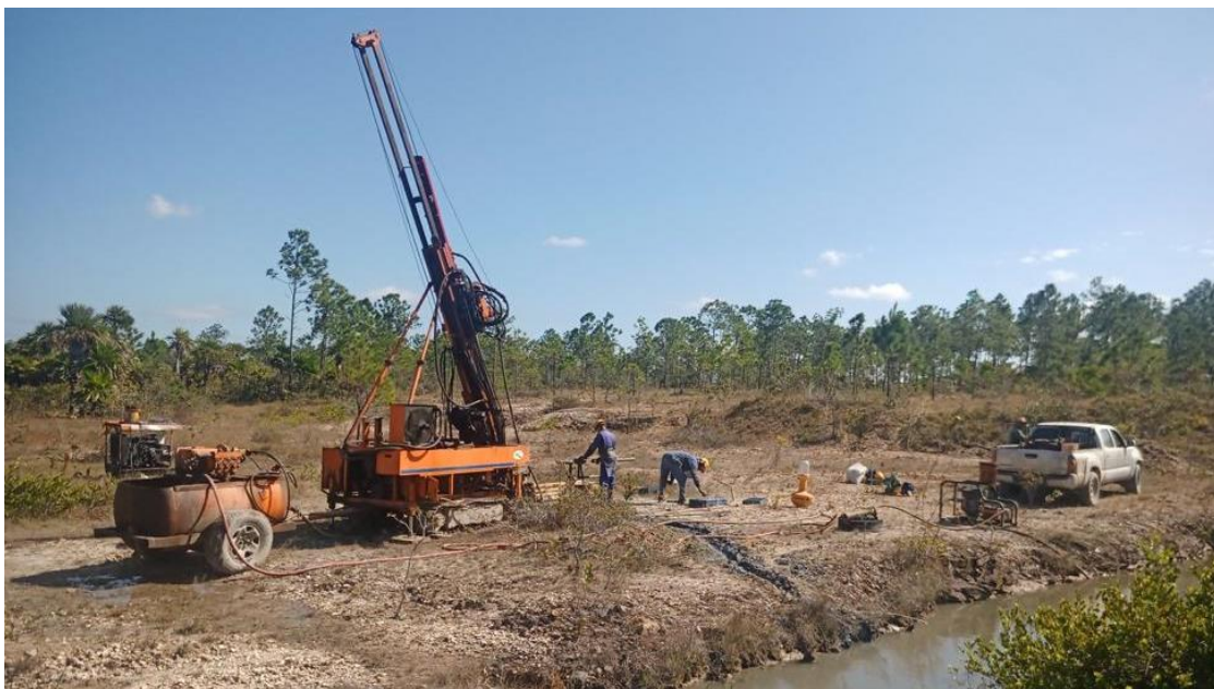
Drilling - El Pilar