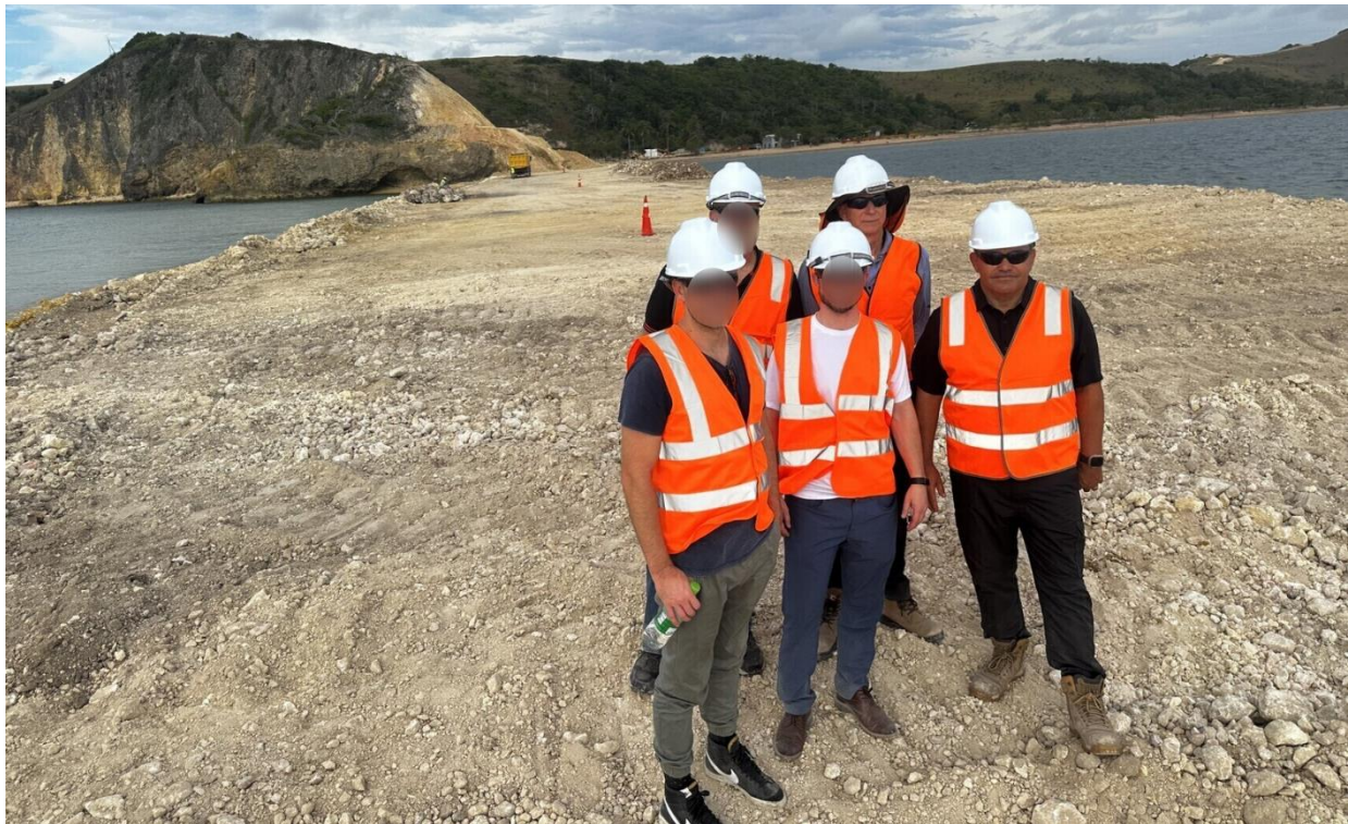
Due Diligence Site Visit

Upon completion with the proposed Private Metals & Mining Fund, in combination with the Vision Blue investment, the CLP will be fully funded.