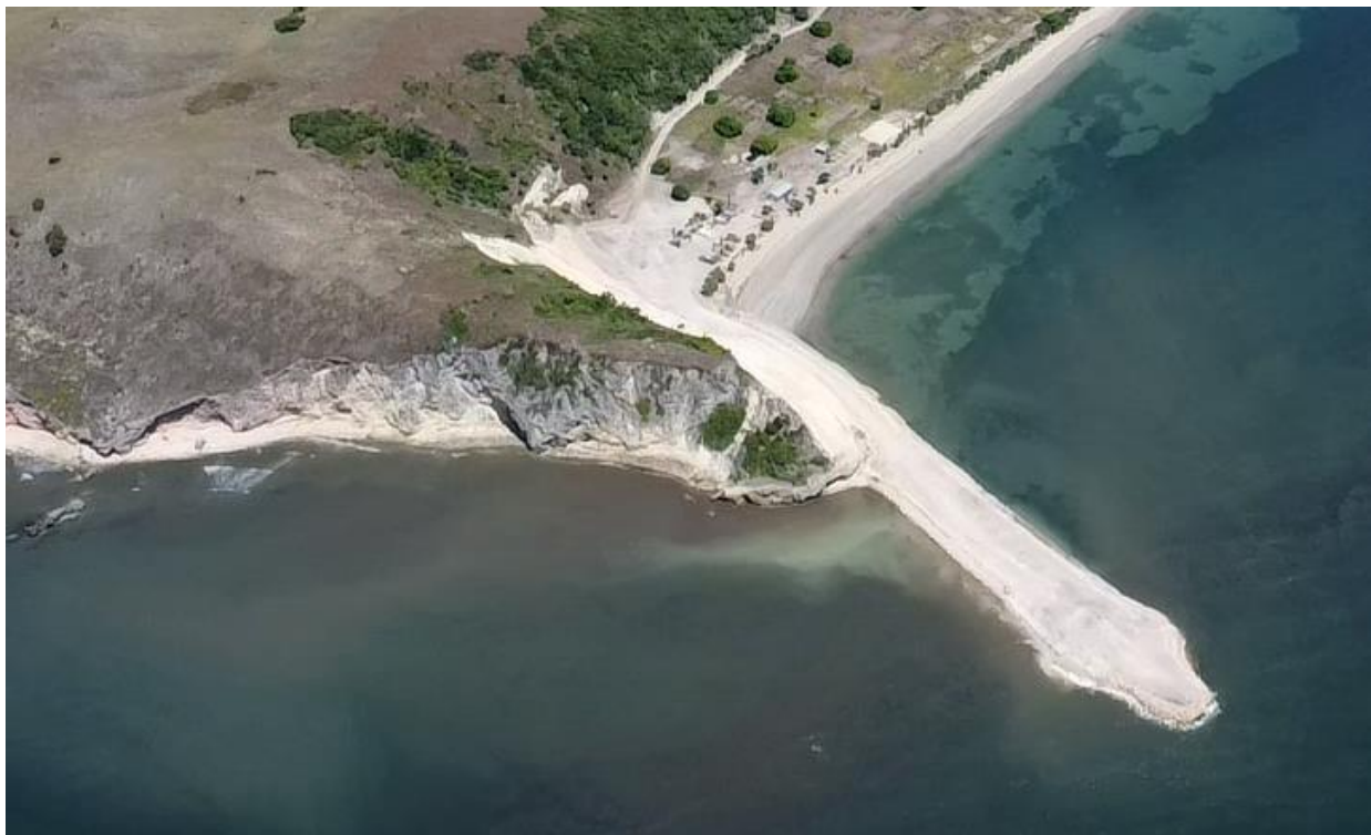
Aerial View of Inner Core of Pioneering Wharf at Central Lime Project