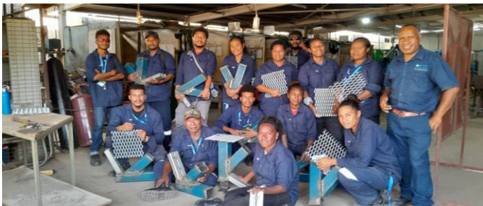
Trainees displaying their project