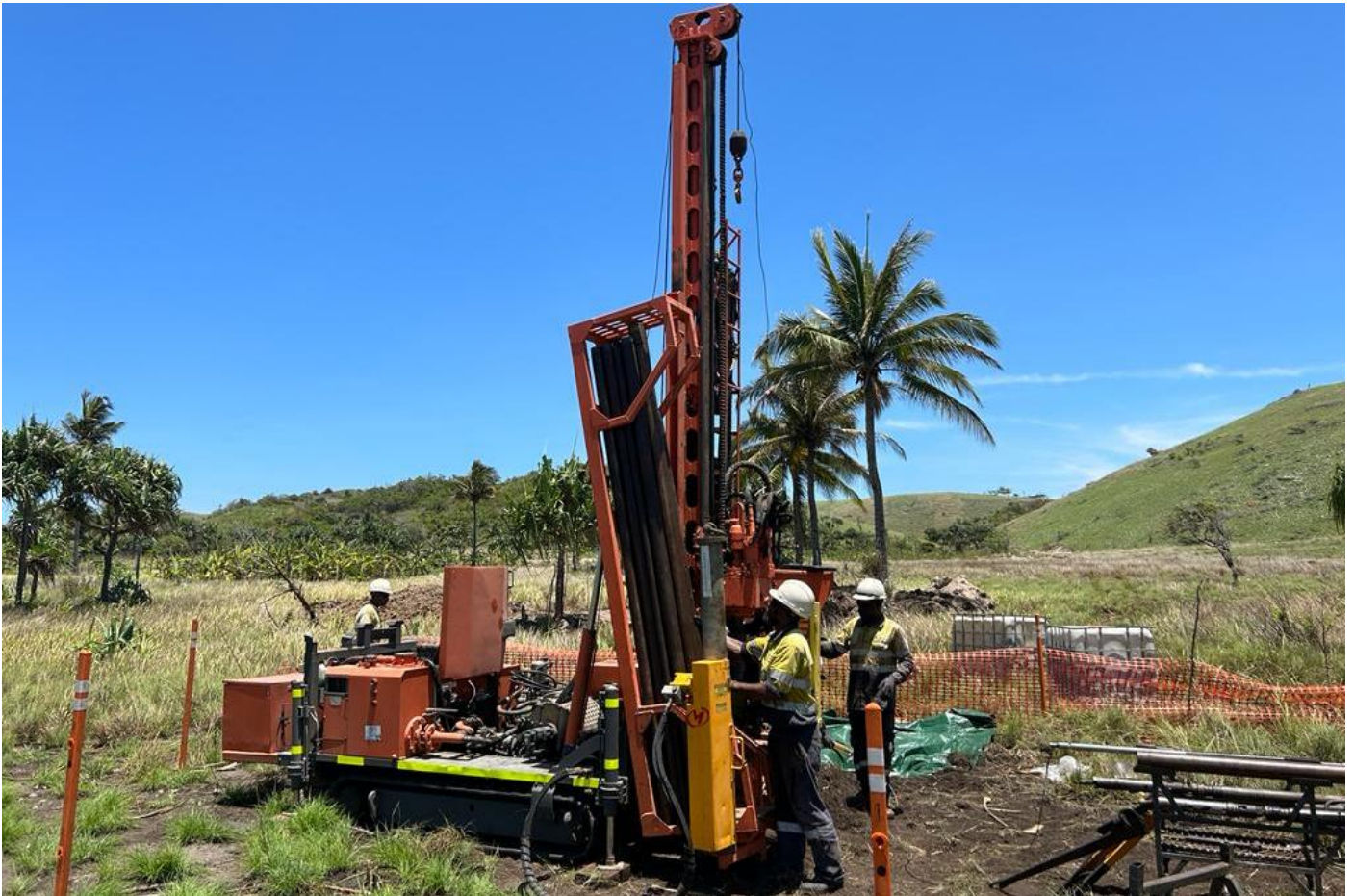
Geotechnical Drill Rig being Setup, October 2023