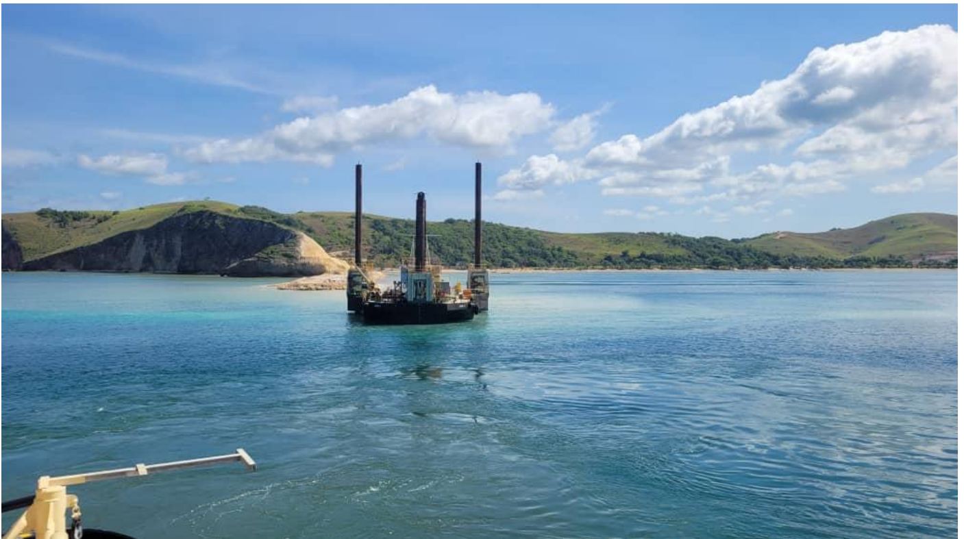
Jack up rig Jake 1 in position and commencing jack up, December 2023

Additionally, Mayur has finished its final on-shore geotechnical drilling campaign to confirm the final location and foundation designs of the Quicklime Kilns and associated infrastructure.