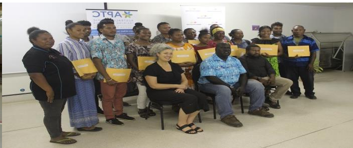
Mini graduation ceremony for trainees