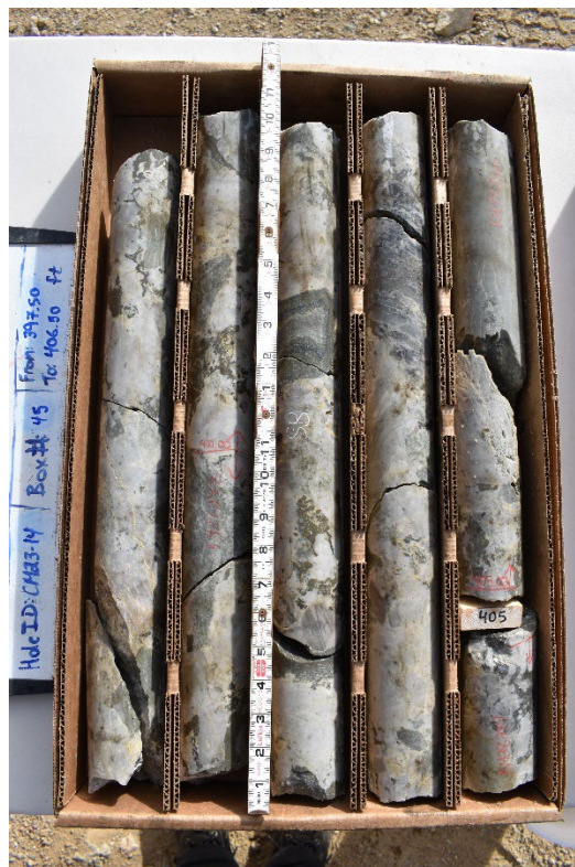
CM24-14 drill hole core. Estimate of sulphide content is 20%

Note: In relation to the disclosure of visual mineralisation, the Company cautions that estimates of sulphide abundance (and assumed gold content) from drill core logging should not be considered a proxy for quantitative analysis of a laboratory assay result. Assay results are required to determine the actual widths and grade of the visible mineralisation, the results of which are expected in February or March 2024.