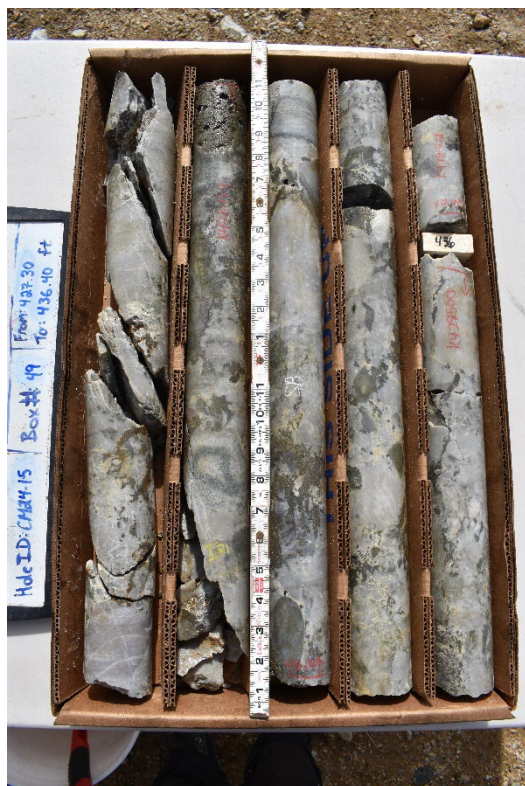
CM24-15 drill hole core. Estimate of sulphide content is 20%

As at the date of this release, the Company has completed 254 metres of the planned 310 metre, CM24-15 diamond drill hole. This hole is intended to test below CM23-14 for continuation of the high-grade gold mineralisation while also testing for any southeast extension of the sedimentary breccia body at depth.