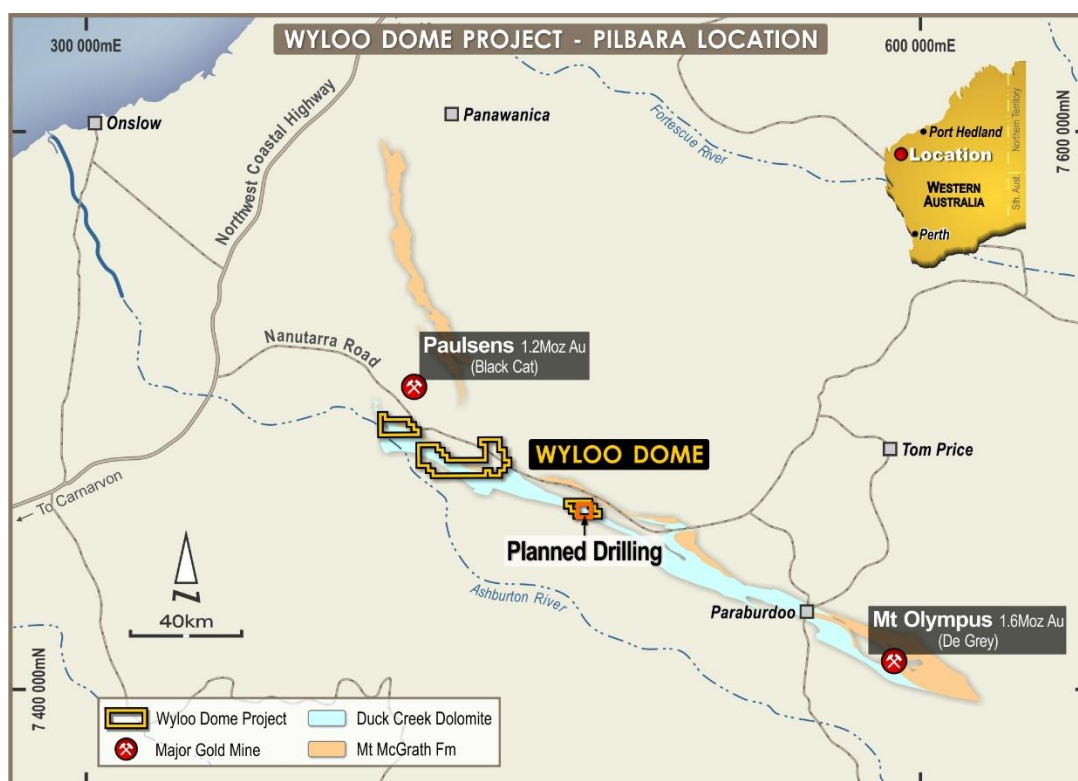
Figure 2: Location of Wyloo JV between Mt Olympus and Paulsens Projects with planned drilling area

The Wyloo Dome Project, in which Woomera can earn up to a 60% equity interest from Nanjilgardy Resources Pty Ltd (“Nanjilgardy”), is located between two plus one-million-ounce gold deposits, Paulsens and Mt Olympus, in the Ashburton region.