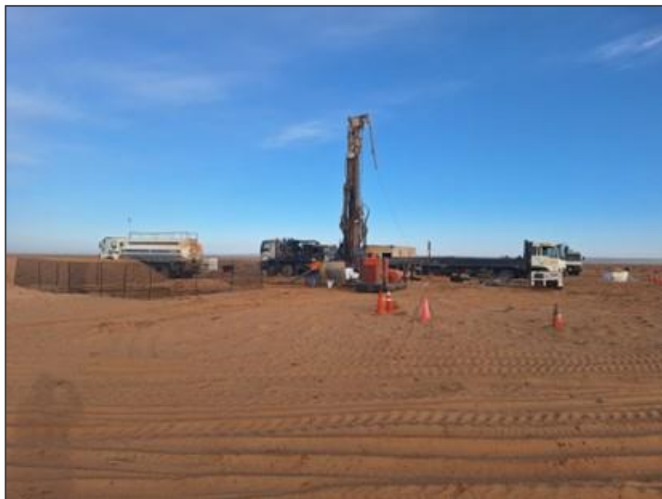
Figure 2. Drilling Water Monitoring Hole at ZUK Basin