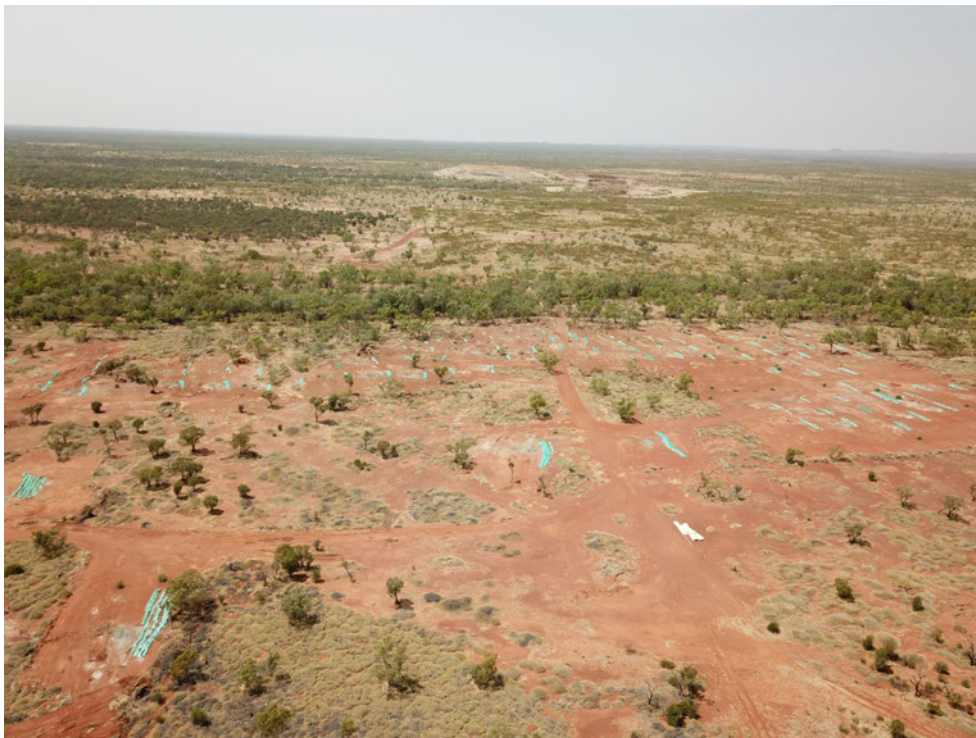
Figure 3. Wallace North Project in preparation for mining (foreground) with Wallace South pits located in the background. Image taken Tuesday 20 March 2024.