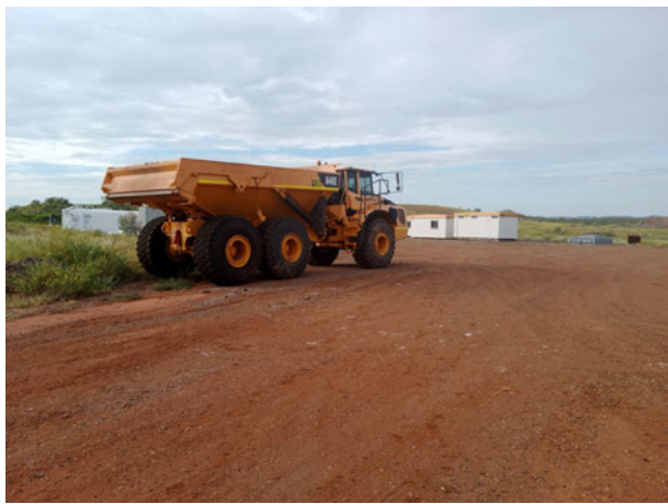
Figures 4 & 5. Equipment mobilising to Wallace North in preparation for mining, images taken Tuesday 20 March 2024.