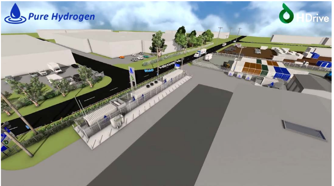
Figure 1: Pure Hydrogen's first micro-hub refuelling site at Archerfield Airport – elevated view

https://purehydrogen.com.au/overview-of-the-archerfield-hydrogen-micro-hub/