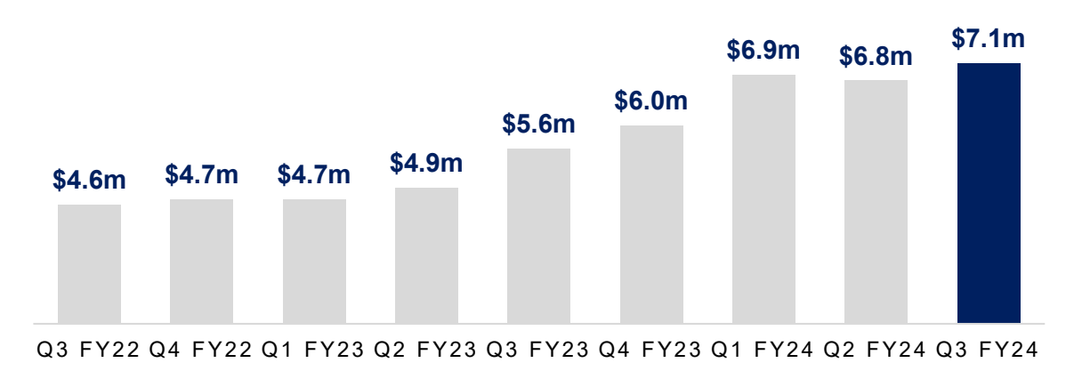
Figure 3. Group Contracted ARR ($m)

Total Group ARR was $7.1m in Q3 FY24, increasing 26% on pcp (refer to Figure 3). Of this, Contractor ARR contributed $5.3m, increasing 45% on pcp, while Felix's Vendor Marketplace contributed $1.9m, broadly in line with the prior quarter.