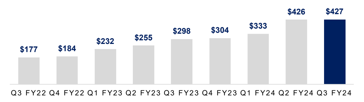
Figure 2. Contractor MRR at close of quarter (A$'000)

Average ARR per Contractor was $99k in Q3 FY24, in line with the prior quarter, reflecting the range of contract sizes signed this quarter. However, relative to Q3 FY23, average ARR per Contractor increased 20% in Q3 FY24. This result is consistent with Felix's strategy of growing average contract sizes over the medium to long term, through the signing of larger Contractor customers and further customer expansions.