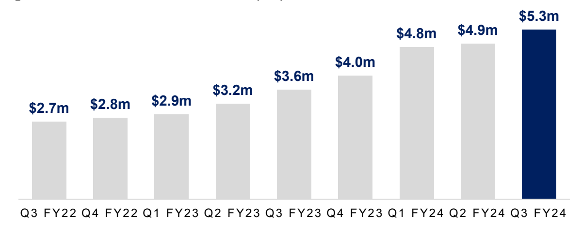
Figure 1. Contracted Contractor ARR ($m)

Felix continues to benefit from structural tailwinds across its target sectors driven by increased sustainability and compliance reporting including ESG, modern slavery, and carbon emissions reporting obligations. A key driver of uptake is the transition away from opt-in to mandatory supply-chain reporting and compliance practices for Contractors across Felix's target sectors. This is evidenced by the wide range sectors Felix has won new contracts in this quarter, including resources, renewable energy, diversified property, infrastructure and construction.