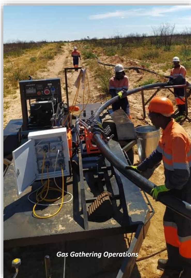
Gas Gathering Operations

In addition, some minor changes to drilling techniques are being assessed with the aim of further increasing gas production rates.