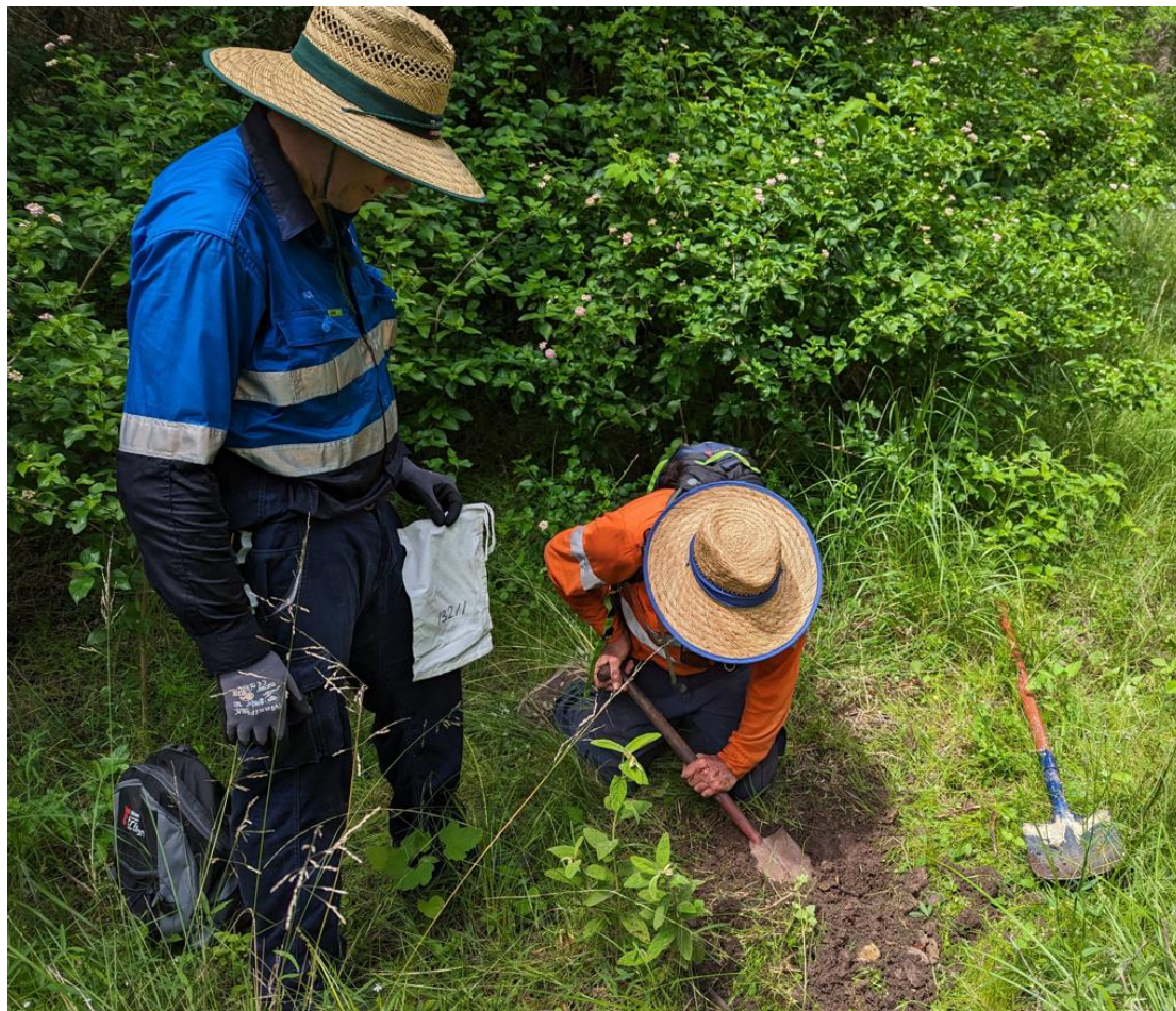
Figure 2: SQX geological consultants collecting soil samples at the Scrub Paddock prospect.

The Scrub Paddock area is prospective for gold-copper porphyry and features more than 20 mineral occurrences and historical mine workings with surface mineralisation extending across a ~2km strike length. Soil sampling and drilling have already confirmed gold and copper mineralisation; the extent of this mineralisation, both along the strike of the surface anomaly and at depth, is unknown.