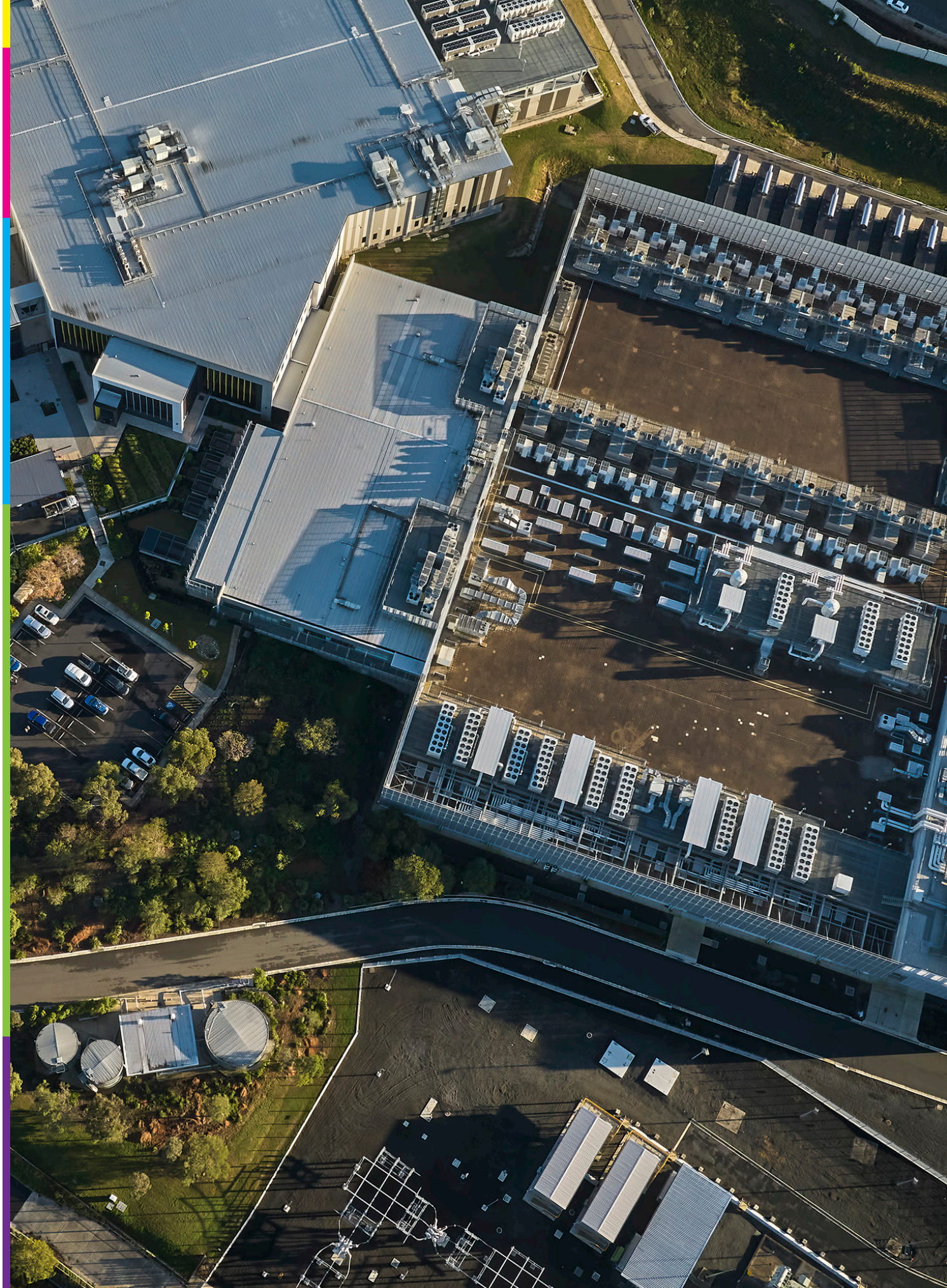
Eastern Creek data centre