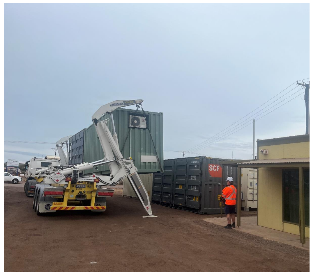
Delivery of modularised FRT pilot plant at Alligator's office/warehouse premises, Whyalla. This announcement has been authorised for release by the Alligator Energy Acting CEO and AGE Board