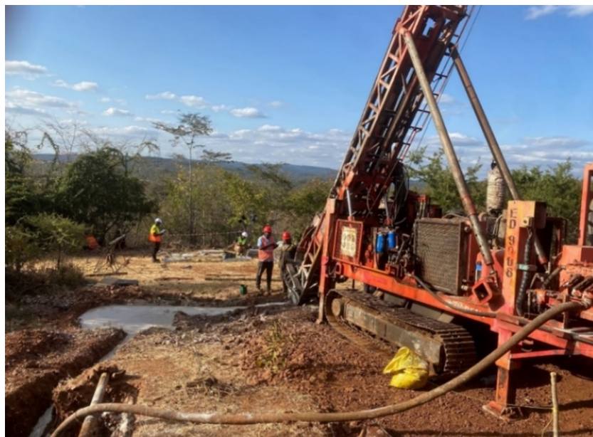
Figure 2: Drilling has commenced at the first drill target

Drilling of the first of the intended target holes (CDD004) as per Figure 2 below has been completed, with an intersection of pegmatite in evidence from 6 m to 14.45 m ( \pm 8.45 m, not true width), close to outcropping pegmatite. Sample coring ceased at 26.3m.