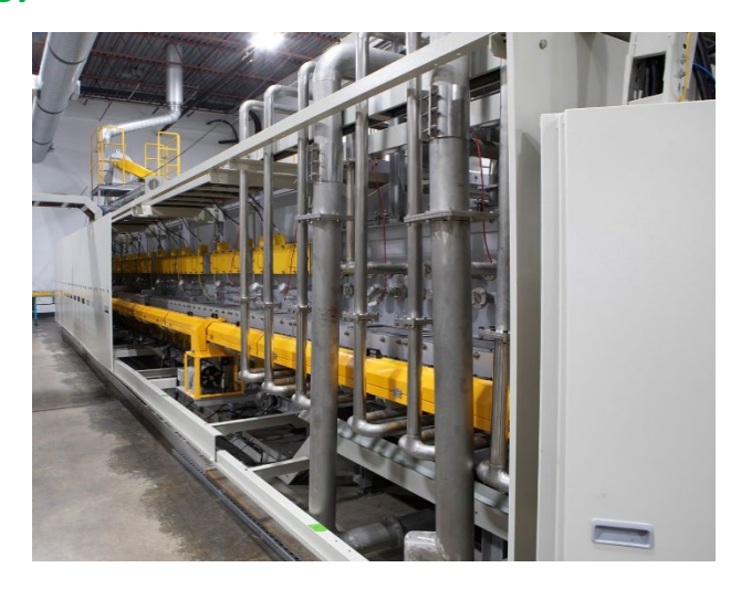
NOVONIX 13.5 m long pilot roller hearth kiln (RHK).

The Company has continued its investment in the development of its all-dry, zero-waste cathode synthesis technology. The 10 tpa pilot line is producing samples for prospective customers and partners, and is reinforcing the viability of the Company's cathode materials and technology for manufacturing purposes. In June, NOVONIX's all-dry, zero-waste cathode synthesis technology was recognized by Reuters Global Energy Transition Awards, winning the R&D Achievement category.