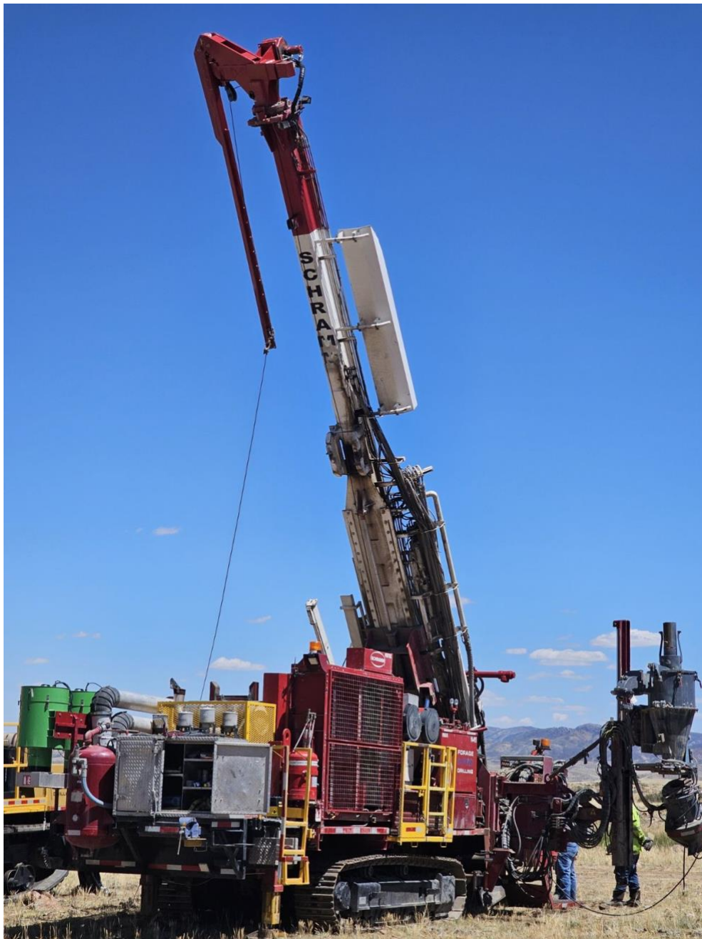
Figure 4 – Reverse Circulation Rig at Hole HC24-RM023