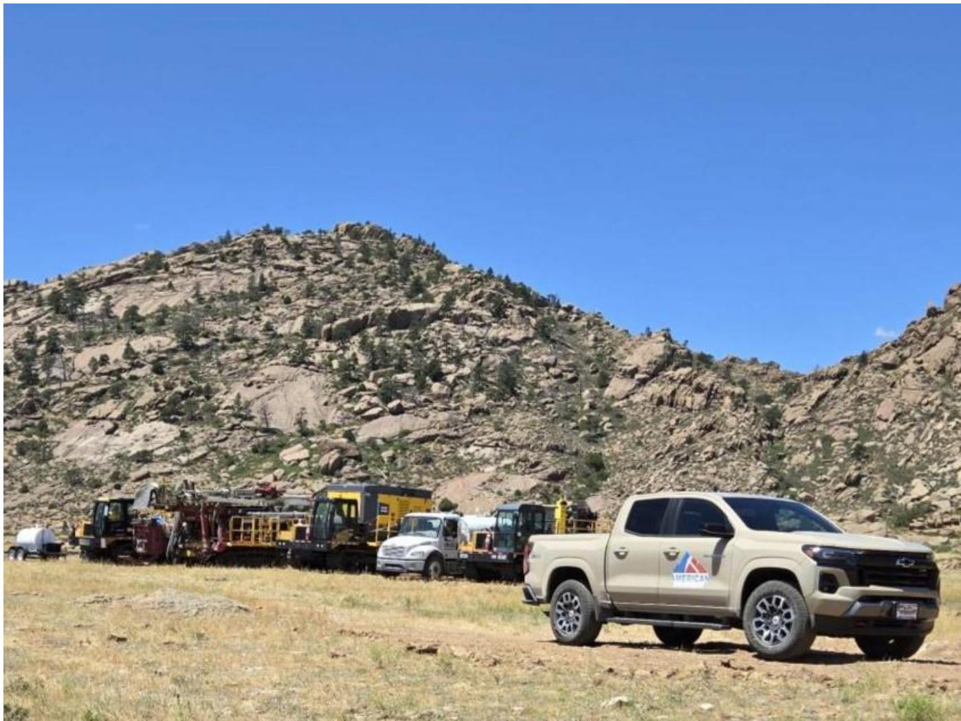
Figure 2 – Exploration Equipment in front of Red Mountain