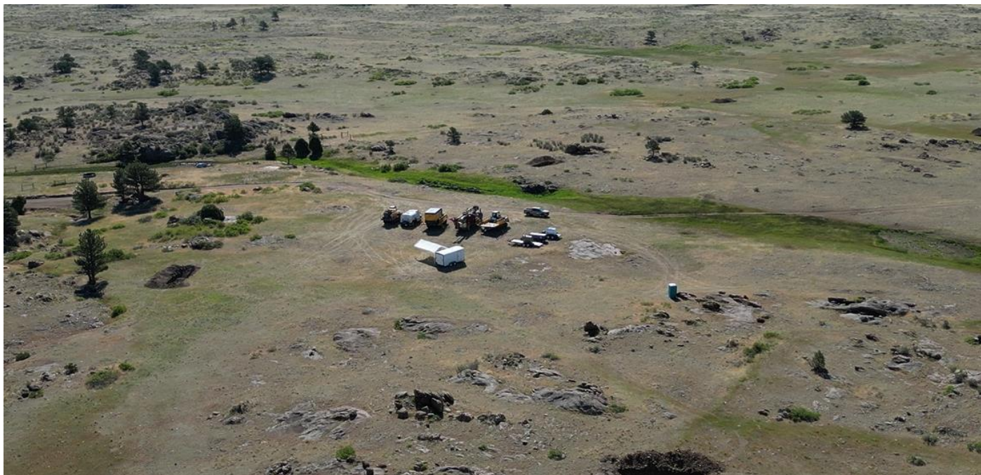
Figure 3 – Staging and Logging Area