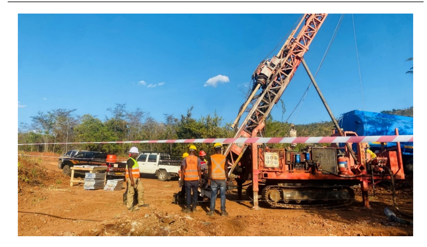
Figure 2: Drill rig onsite at the final drill hole at the Chenene Project

"We are excited to have successfully completed our initial drilling program at the Chenene Lithium Project in Tanzania. The program forms a key part of the Company's due diligence in respect of our Option to acquire the Project. We now eagerly look forward to receiving results. The program was expanded to nine holes, and core samples are currently being progressively submitted for laboratory analysis, with results expected in the following month."