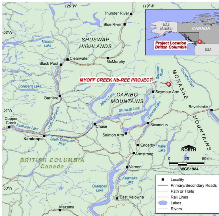
Figure 1 – Myoff Creek Project location

Empire Capital Partners Pty Ltd will be paid an introduction fee comprising 10M options exercisable at 3c on or before 30 April 2027 as a result of the NAE option agreement being entered into. The issue of both these options and the 28.5M options to be issued as part of the acquisition of NAE is subject to approval being obtained from AuKing shareholders at an EGM to be convened shortly.